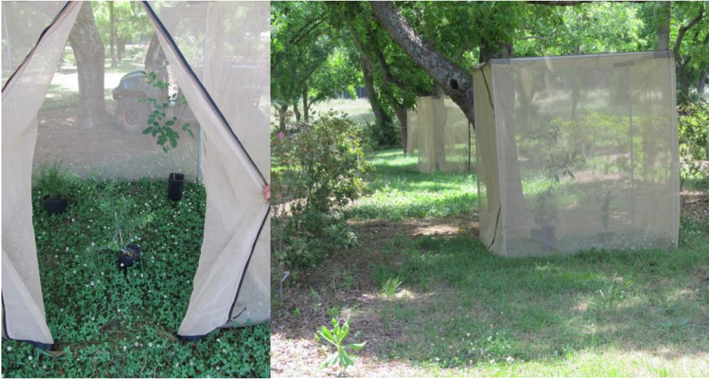
Figure 2.3. Field host choice test of L. mutica testing their response to intact potted plants of three different plant hosts (swamp privet, Chinese privet, and green ash).