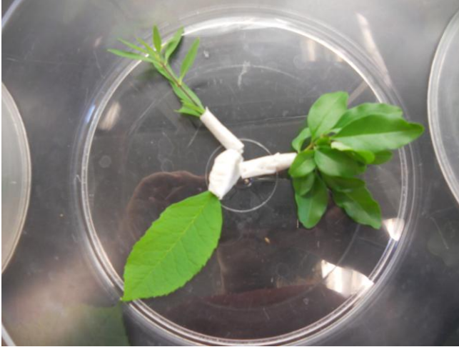
Figure 2.2. Laboratory study testing L. mutica host choice among three plant hosts (swamp privet, Chinese privet, and green ash).