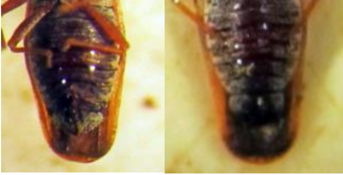
Figure 3.3. Gender of L. mutica determined by females having rounded abdomen with ovipositor (pictured left) and males having pinched abdomens (pictured right)