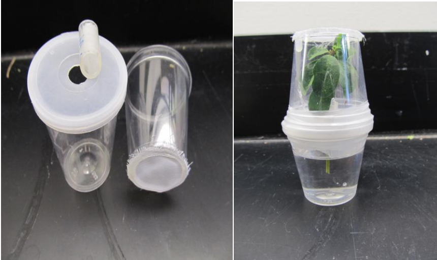
Figure 3.1. Cages used for developmental studies. Plant material was inserted through tube into lid covered water - filled diet cup. Parafilm was wrapped around the stem and tube, so insects could not get into the water cup. The bottom of another diet cup was cut out and covered with screen and then placed upside down on top of the water cup with cutting. The two cups were secured together with Parafilm.