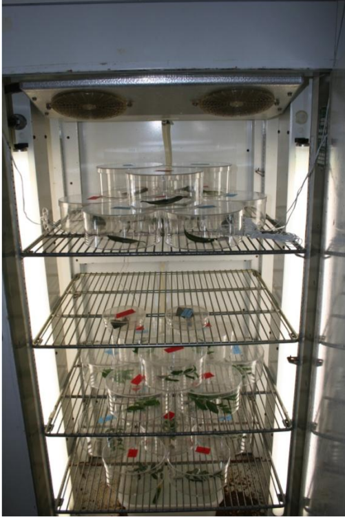
Figure 2.1. No choice test of two L. mutica populations collected from fringe tree or swamp privet in an experimental growth chamber using three plant hosts (fringe tree, swamp privet, and Chinese privet).