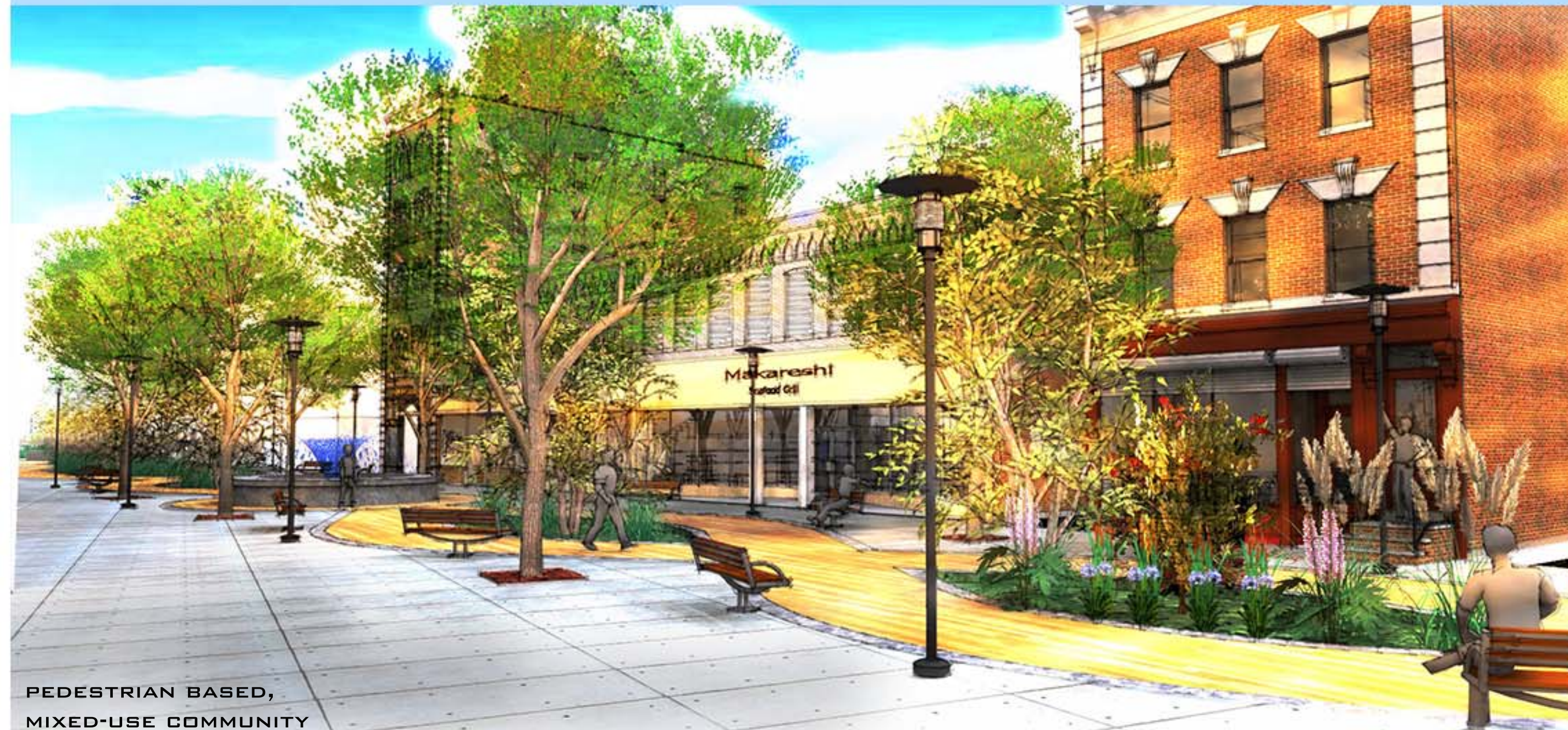
PEDESTRIAN BASED, MIXED-USE COMMUNITY