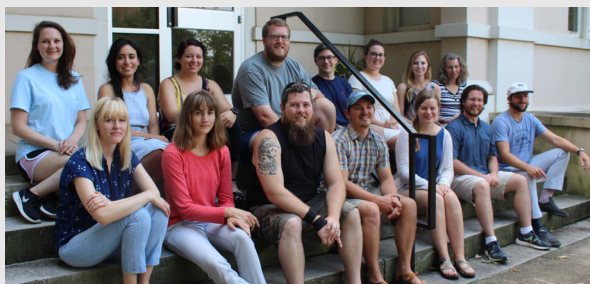
The new MHP class visited Shields-Etheridge Farm and Washington, Ga. during orientation. Here they are pictured in front of historic Denmark Hall.