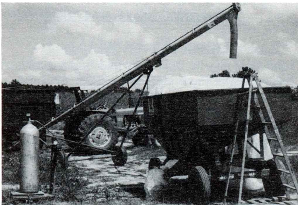
Figure 1. Corn to be treated is sealed in a plastic bag placed in a hopper bottom wagon.