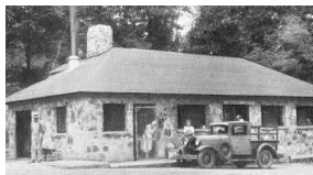
Community Cannery, 1935

The stone building that is now the interpretive center was built during the Depression in 1935 by the CCC with funding made available through the Federal Emergency Relief Administration (FERA).