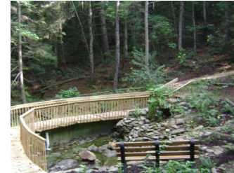
Old spring house site

The head of the medicine trail was the site of an old spring house that once provided water to the Jarrett House and the cannery. The area, planted with shade-loving woodland natives, is now a quiet resting place.