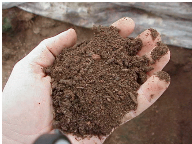
Stable compost serves as an excellent soil builder.

Composting is the controlled biological process of decomposition and recycling of organic material into a humus rich soil amendment known as compost . Mixed organic materials ( Example: manure, yard trimmings, food waste, biosolids) must go through a controlled heat process before they can be used as high quality, biologically stable and mature compost (otherwise it is just mulch, manure or byproduct). Compost has a variety of uses and is known to improve soil quality and productivity as well as prevent and control erosion.