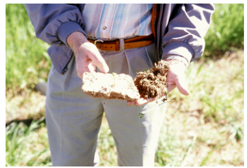
Development of soil crust reduces infiltration, causing more runoff and erosion.