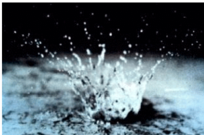
Raindrops hitting a soil surface will detach and erode soil particles.

Sheet erosion is the removal of a fairly uniform