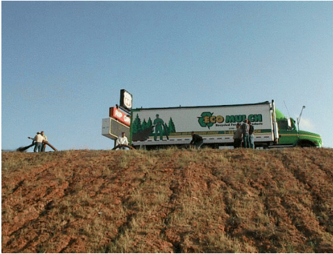
Rills are often obvious on steep or unprotected banks.