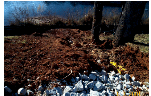
Eroding slopes can lead to sediment build-up in water bodies.