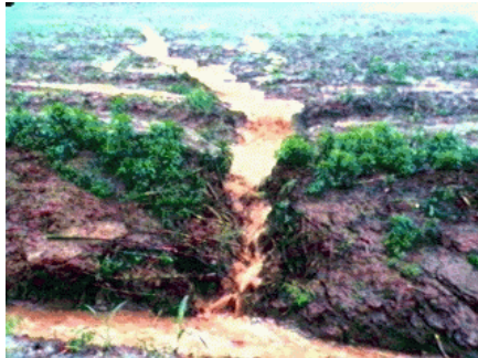
Erosion is especially critical in areas where runoff enters a stream or gully.