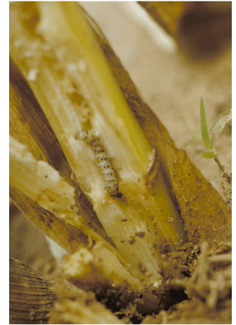
Figure 13. Southwestern cornstalk borer tunneling in sorghum stalk

seed treatments normally are not justified specifically for aphid control, but if used they will control aphids for about 20 days after planting.