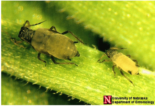
Figure 11. Corn leaf aphids.