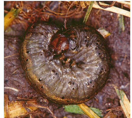
Figure 8. Cutworm.

bore into the stem base often killing the main growing point. Larvae are blue-green with transverse brown bands. LCSB is easily identified because larvae are usually enclosed in a silken tube, which has incorporated soil particles. LCSB is favored by conventional tillage under hot, dry conditions, sandy soils, double-cropping behind cereal grains, and planting into burnt cereal grain stubble. Preventive insecticides best control LCSB. Rescue treatments, once damage is detected, often are ineffective.