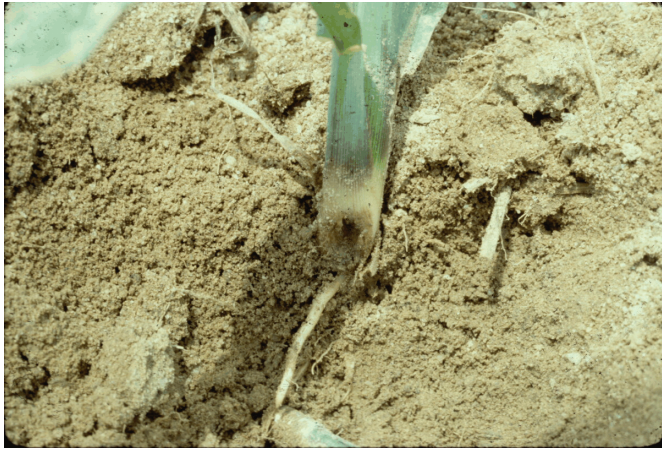
Figure 4. Insect feeding destroying main stem.