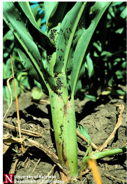
Figure 10. Chinch bugs on sorghum stalk.

When to treat: Aphids seldom require control in Georgia. Usually natural enemies such as lady beetles, hover fly larvae, parasitic wasps and others will control aphid infestations. However if aphids, especially greenbug and yellow sugarcane aphid, persist and are discoloring and stunting seedlings, an insecticide treatment may be needed. In larger plants, an insecticide treatment may be needed if aphids are causing the discoloration and death of two or more leaves. Systemic