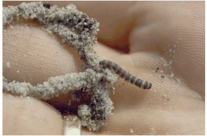
Figure 5. LCSB larva.