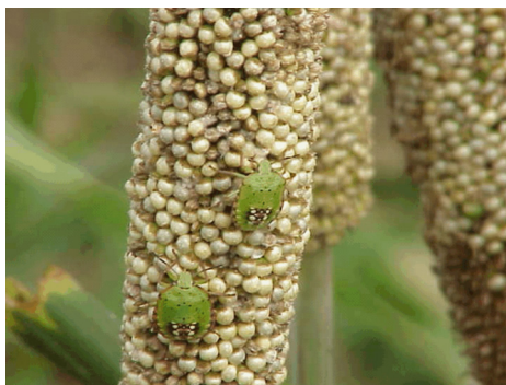
Figure 17. Southern green stink bug nymphs on pearl millet.