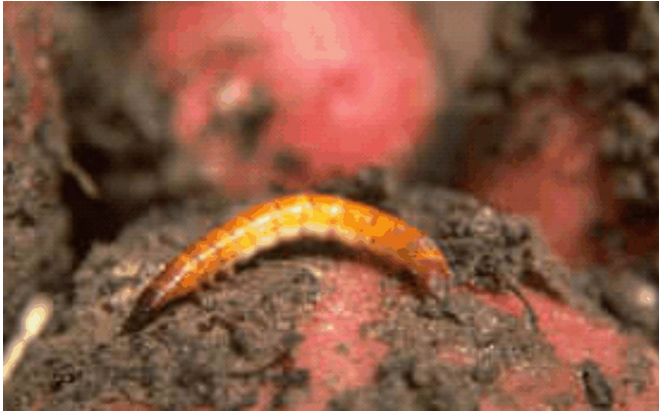
Figure 1. Wireworm.

presence of white grubs, wireworm or whitefringed beetle larvae. Since these insects will go back to the soil within seconds, make inspections immediately after turning the soil. Inspect the root systems, and soil around the roots, of any weeds present for these insects and their feeding damage. Soil insects will destroy seed causing gaps in the stand. They also can bore into seedling plants below the soil surface killing the main stem, which kills the leaf whorl causing a “deadheart” type injury.