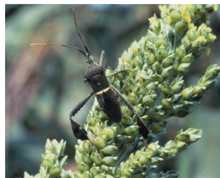
Figure 18. Leaffooted bug on sorghum panicle.