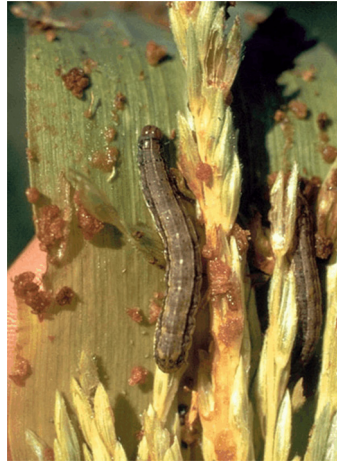
Figure 12. Fall army-worms.