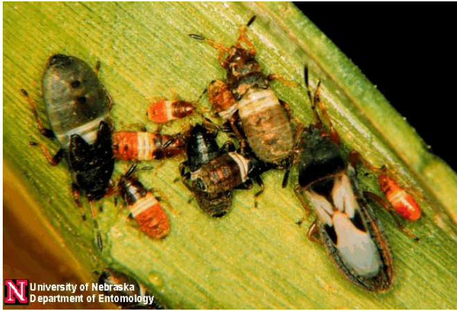
Figure 9. Chinch bug nymphs and adult.

becoming dark gray just before adulthood. Nymphs also have a white stripe across the back.