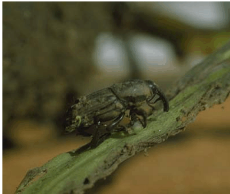
Figure 6. Billbug.