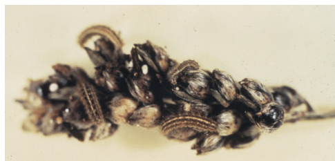
Figure 16. Sorghum webworms on sorghum panicle.

When to treat: Treat if combined numbers of all stink bugs (large nymphs and adults) exceeds four bugs per head during milk stage or eight bugs per head during soft dough stage. Insecticides recommended for stink bug control also will control headworms. However, some of the insecticides recommended for head-