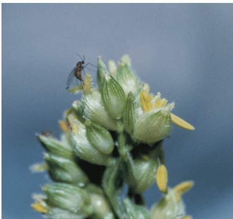
Figure 14. Sorghum midge on sorghum panicle.

Sorghum midge ( Stenodiplosis sorghicola ) has the potential to be a devastating pest of sorghum in Georgia. The adult is a tiny, fragile-looking, orange-colored gnat-like fly. Females lay eggs singly in sorghum flowers during pollination. The larva is an orange maggot that feeds on the developing seed. When larvae are full size they pupate within the flower. The pupa pushes its way to out and adults emerge