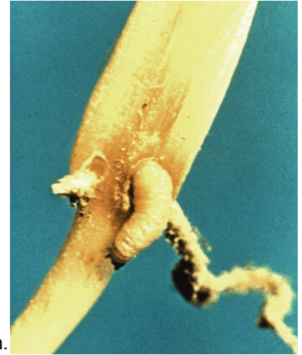
Figure 2. Rootworm.

Soil insecticides are not routinely used at planting in grain sorghum. However, if one or more of the above conditions exist, it is appropriate to consider the use of an at-planting insecticide or seed treatment. The best way to apply an at-planting granular insecticide on