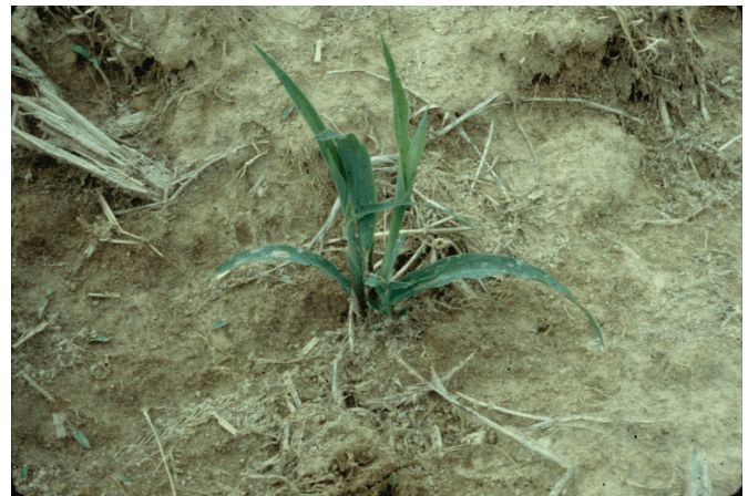
Figure 3. Damaged seedling with suckers.

Lesser cornstalk borer ( Elasmoplapus lignosellus ) is a moth. Larvae feed below the soil line where they