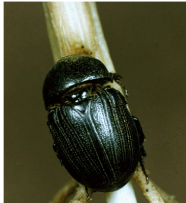
Figure 7. Sugarcane beetle.