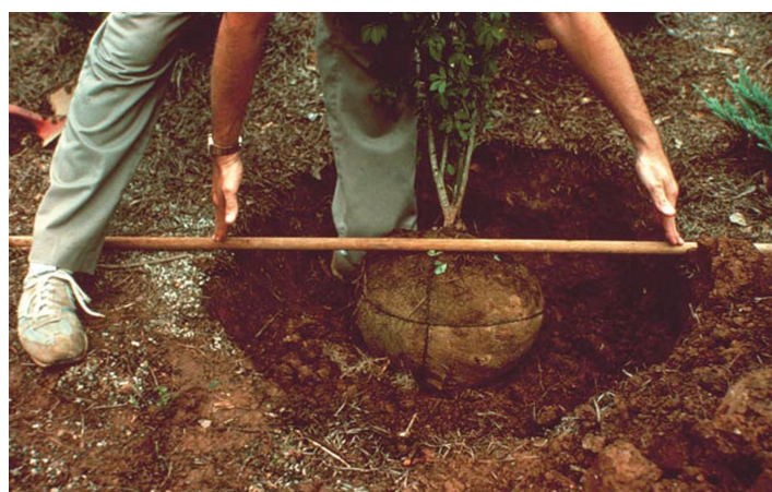
Figure 3. Dig the planting hole two times wider than the root ball. Make certain the top of the root ball is level with the soil surface.