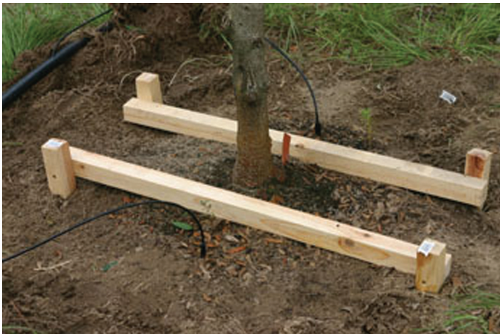
Figure 9. A root ball staking system is an alternative to guy wires.