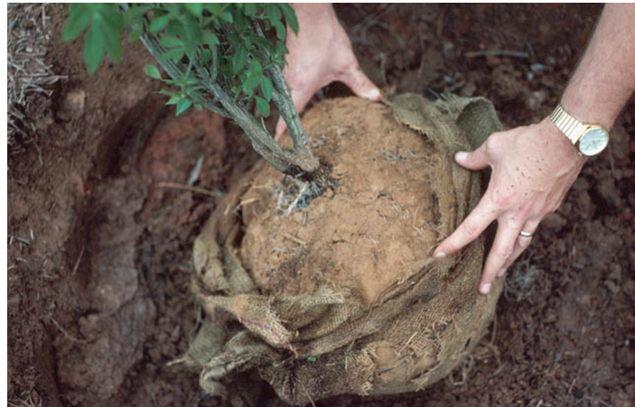
Figure 4. This balled-and-burlapped plant, with the cord cut from around the trunk and the burlap pulled back, is ready for planting.