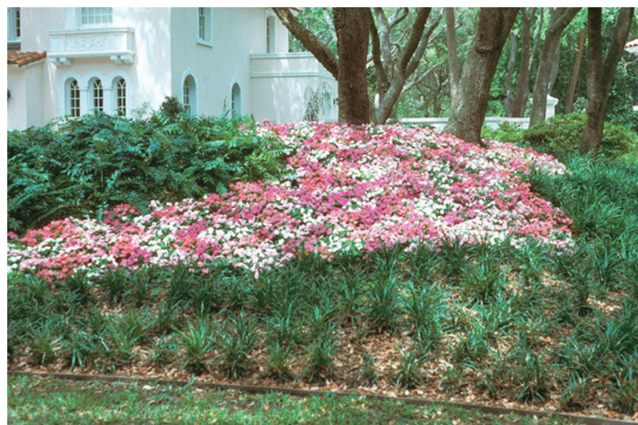
Figure 6. Plant annuals and perennials on raised beds to ensure good drainage and improved visibility.