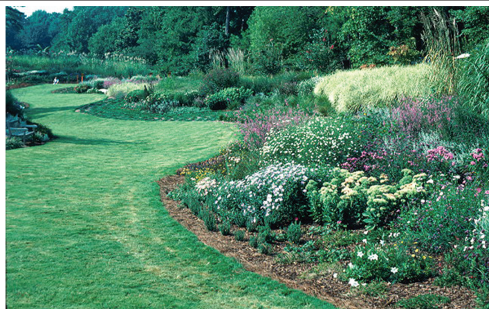
Figure 1. Ornamentals can be grown on poorly-drained soils if they are planted on raised beds.