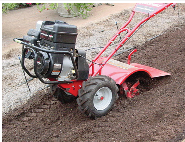
Figure 5. When planting a group of ornamental plants in the landscape, prepare a good bed by deep tilling to a depth of 12 to 15 inches.