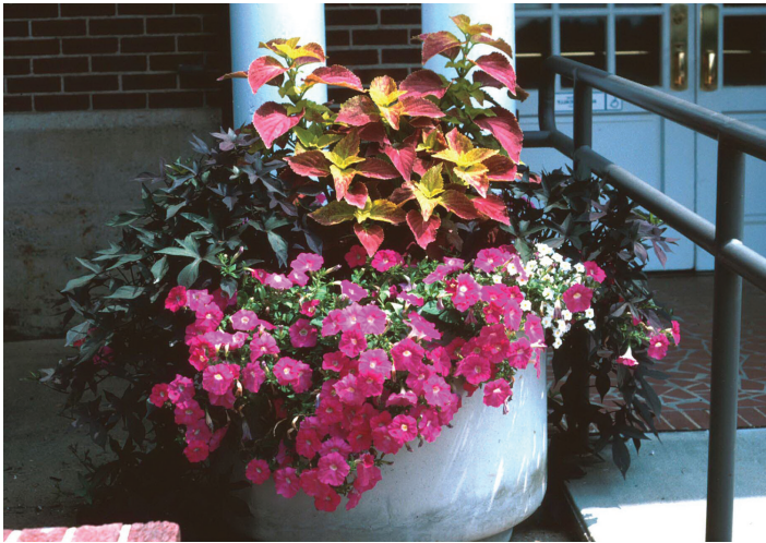
Figure 7. Containers let you put splashes of color where you want it, regardless of soil type, and offer an alternative to flowerbeds. For best results, use quality potting soil and a well-drained container.