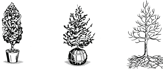
Figure 2. Woody ornamentals for the landscape are commonly sold three ways: container-grown (left), balled-and-burlapped (center) and bare-rooted (right).