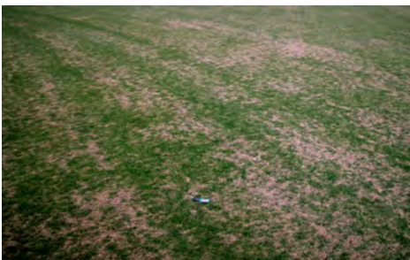
Fertilizer misapplication.