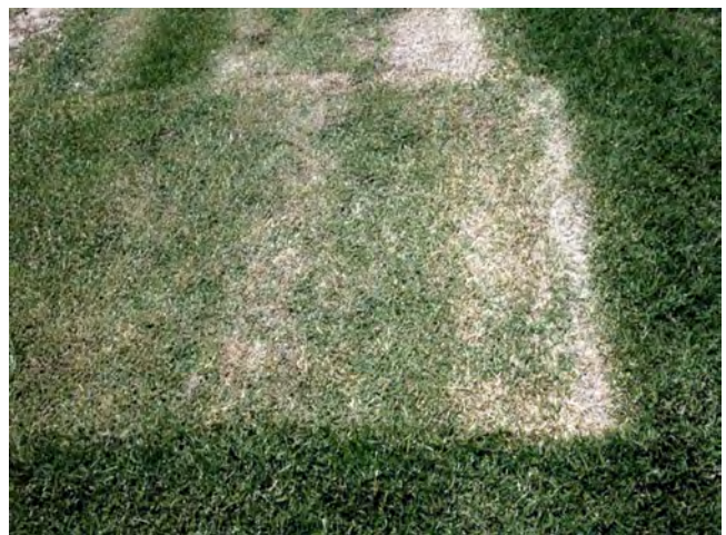
Scalping injury on Bermudagrass.

Turfgrass in high traffic areas may suffer from problems not always obvious to the eye. Shallow soils and compaction can result in root growth being restricted. The result is increased sensitivity to environmental fluctuations. Soils under turfgrasses in high traffic areas are often compacted, which restricts water infiltration and percolation, gas exchange, nutrient acquisi-