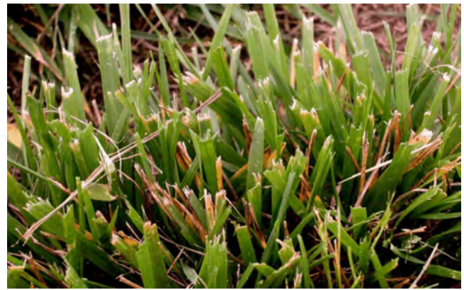
Dull mower blade injury.