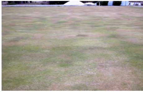
Bentgrass affected by cold temperatures.