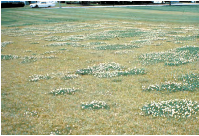
Nitrogen deficiency.

and are often difficult to mow. Iron deficient turfgrass may appear as a mosaic of chlorotic patches. Soil conditions leading to iron deficiencies include high pH, high soil phosphorus levels, high soil nitrogen levels, sandy soils and cold, wet soils. Many products are available for foliar application of chelated iron. Color enhancement occurs within hours of the application and lasts two to three weeks during wet periods or several months during cool, dry periods, depending on growth conditions.