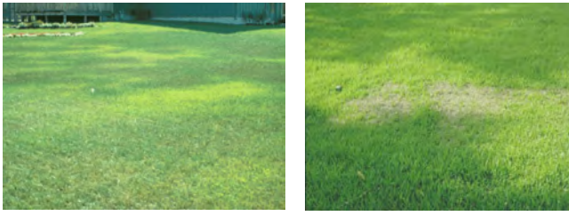
Drought injury.