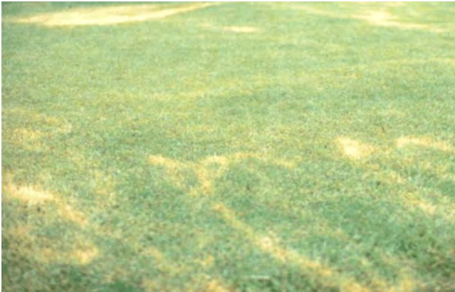
Herbicide damage.