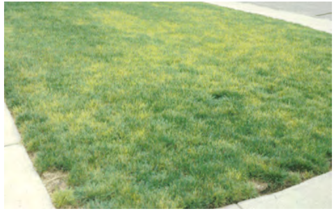
Iron deficiency.

Dull mower blades shred the tips of grass blades. Affected blades appear to have small “threads” extending from them. These threads are the protruding vascular bundles of the grass blades. Shredding of the tips causes them to