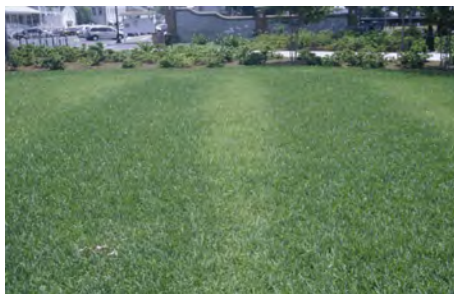
Fertilization skips.