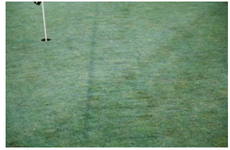
Battery acid tracking.

line often appears as a roughly circular dead area with a definite margin. To reduce damage, fresh spills can be treated with detergent followed by an absorbent, such as activated charcoal to reduce damage. Acting quickly and containing the spill with absorbent materials will greatly reduce damage. In extreme circumstances, small damaged areas can be cut out and replaced.