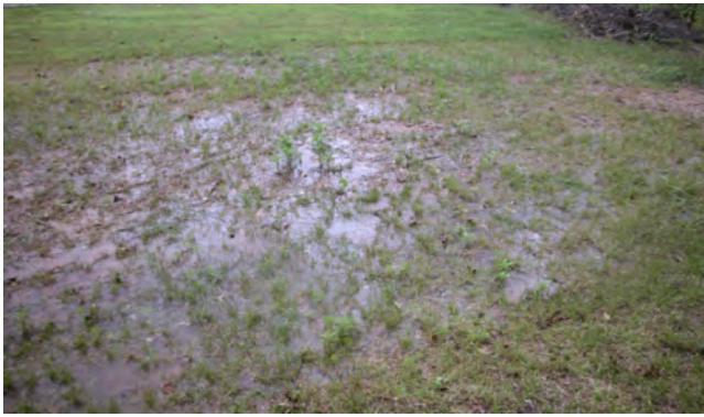
Turfgrass damage due to excessive wet or low areas.

die from a lack of oxygen. Drought damage develops in plants when water use rate or evapotranspiration rate exceeds the rate of water absorption by the roots. As the soil dries, the ability of roots to absorb water decreases and moisture stress develops. As this condition intensifies, leaves lose turgor, wilt, turn yellow, and eventually die. Water deficiency is normally corrected by rainfall or supplemental irrigation.