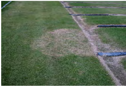
Lubricant spill.