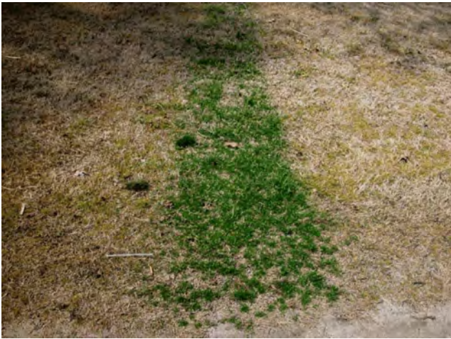
Herbicide damage on Bermudagrass.