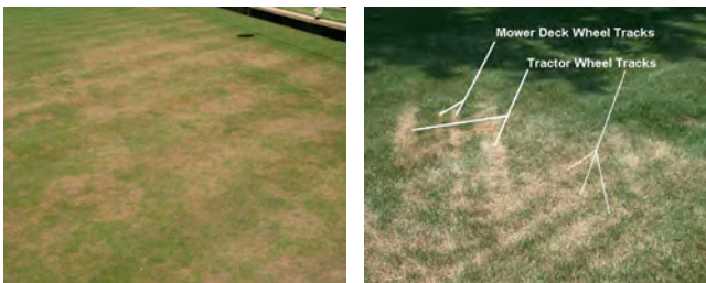
Heat damage.

High temperature damage can be caused by direct solar radiation, reflected solar radiation from windows or other similar reflective sur-