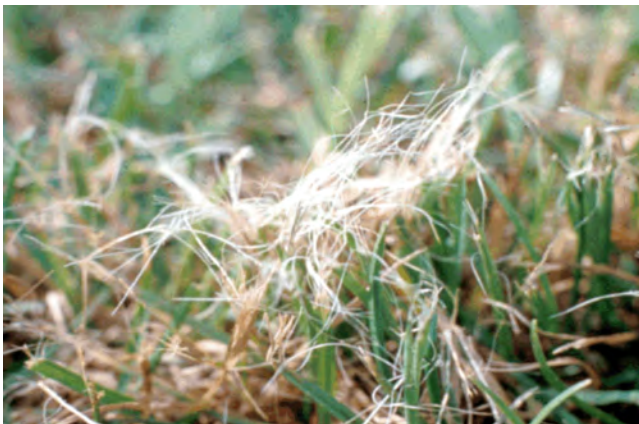
Dull mower blade/shredding injury.

Symptoms of compaction include thinned turfgrass; increased sensitivity to drought; rust diseases, weed infestations and temperature stresses. Turfgrasses in these areas appears brown or to have low overall turfgrass quality. Extensive renovations or mechanical aeration can help correct compaction depending on the extent of the problem. In the long run, redirection of traffic from the problematic area will prove beneficial. Turfgrasses that show increased tolerance to both wear and compaction also can be selected. The goal of any corrective measure is to improve the soil environment and stimulate deep rooting, which allow the grass to recover from use and moderate environmental stresses.