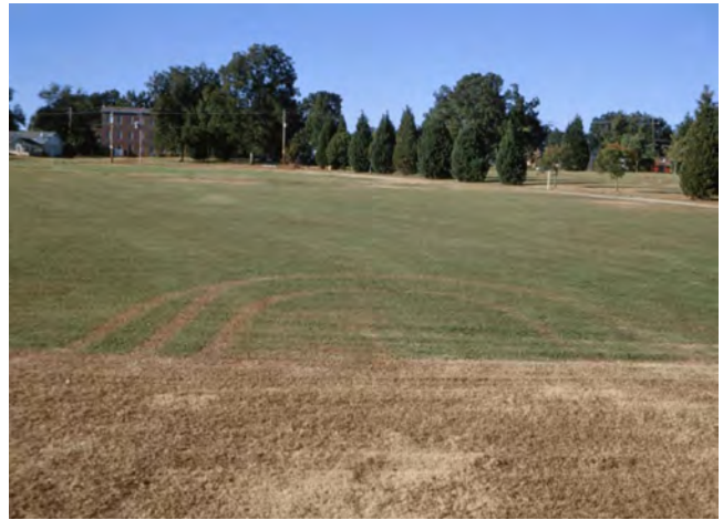
Herbicide tracking.