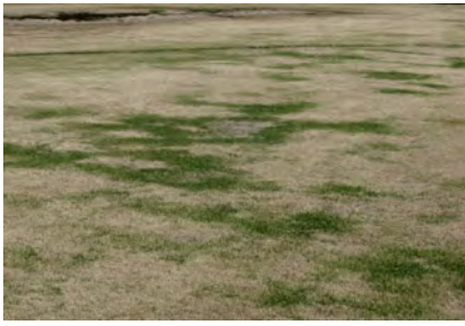
Zoysiagrass affected by cold temperatures.