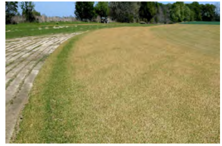
Centipedegrass affected by cold temperatures.

plants emerge from winter dormancy. Intermittent warm weather can induce plants to resume growth and thereby use stored energy reserves (carbohydrates). If freezing temperatures occur, however, the turfgrasses are less capable of emerging from winter dormancy and may be killed altogether.