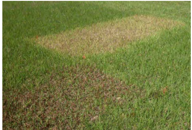
Damage from herbicides on an experimental trial.