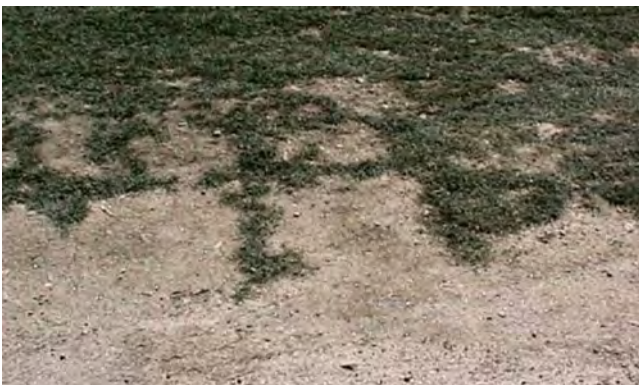
Soil compaction.