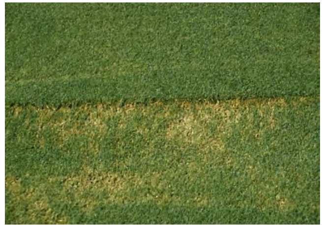
Scalping injury on Bentgrass.