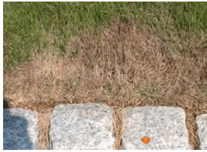
Exhaust damage.