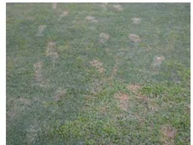
Ammonium nitrate injury.