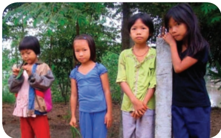
full futures for all page 7

making a difference in the lives of people