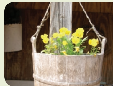
Some of the many sights visitors will enjoy while visiting Whippoorwill Organic Farms.