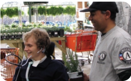
future leaders page 6