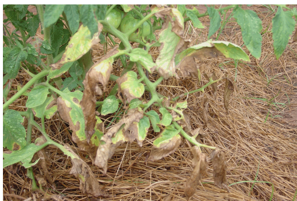
Early blight on tomato plant leaves.

Insecticidal soap and Bt ( Bacillus thuringiensis ) are used by many organic gardeners with fair success. Repeated applications and scouting for pests frequently are necessary for continued control. A general purpose garden insecticide applied according to label directions