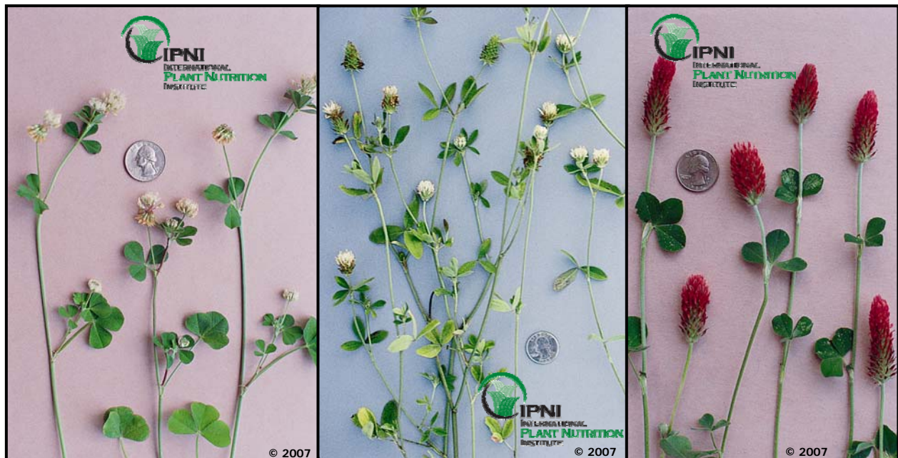
Ball Clover ( Trifolium nigrescens )

Crimson clover often serves as a benchmark for other cool season annual legumes. Crimson furnishes some grazing in late fall and winter and abundant grazing in early spring. Crimson matures (flowers) earlier in spring than other annual clovers, has a shorter grazing season and produces high yields even in cool winters. Several varieties are now available that mature very early, allowing it to grow, be used, add biologically-fixed N to the soil and die with minimal competition with warm season perennial grasses. It grows best on well-drained soils and is frequently used in mixtures with ryegrass and small grains for winter grazing. It is also commonly used to overseed bermudagrass and bahiagrass pastures. Unfortunately, crimson produces relatively little hard seed and its seed heads are often damaged by clover head weevils. As a result, crimson clover usually does not reseed well in a grazing system.