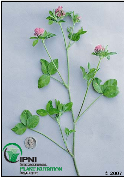
Red Clover ( Trifolium pratense )