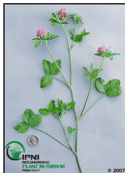
Red Clover ( Trifolium pratense )