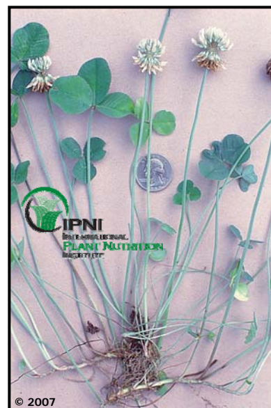
White clover ( Trifolium repens )

Red clover, a short-lived perennial legume, is adapted to a fairly wide range of soils. It is deep-rooted and, like alfalfa, does best on well-drained sites. It tolerates lower fertility and soil acidity than alfalfa, but persists better under good fertility. Red clover stands generally start to thin the second year. Some stands in Georgia have persisted for several years (most likely as a result of reseeding). Red clover is best adapted to heavy, fertile soils in north Georgia and can be seeded into tall fescue or orchardgrass stands with white clover. Red clover does not tolerate close grazing and will not produce or survive well in continuously-stocked pastures. Diseases also may limit stand life during cool, moist springs.