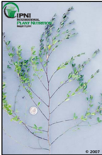
Striate Lespedeza ( Kummerowia striata )