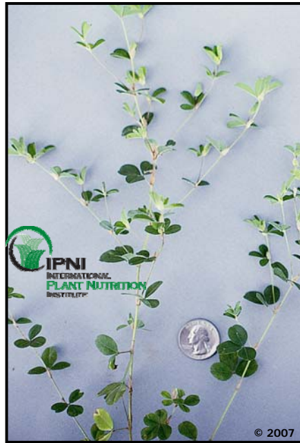
Korean Lespedeza ( K. stipulacea )