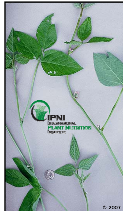
Forage Soybean ( Glycine max )

Forage soybeans are typically harvested for hay or silage; however, they can be used for late summer temporary grazing. Since they do not regrow once defoliated, strip-grazing (or frontal grazing) is the most efficient use. Soybean forage is fairly digestible (up to 60 percent) and moderately high in CP (17 to 19 percent). Stem size can be reduced, thus increasing digestibility, if seeding rates of 90 to 120 lbs. of seed per acre are used. Planting late-maturing varieties (maturity groups 6, 7 or 8) from early May to early June will result in forage soybean production best suited for high yields. Shorter periods of growth, such as part of a double- or triple-crop system, can be accommodated with early-maturing varieties. However, productivity is expected to be substantially less.