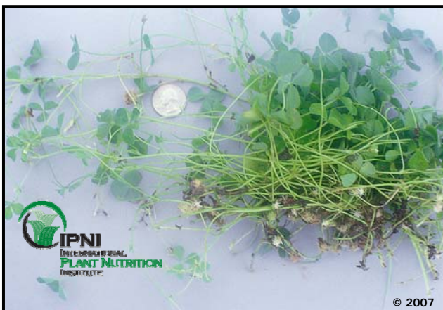
Subterranean Clover ( T. subterraneum )