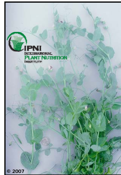
Winter pea ( Pisum sativum )

( http://www.caes.uga.edu/commodities/fieldcrops/forages/species.html ).