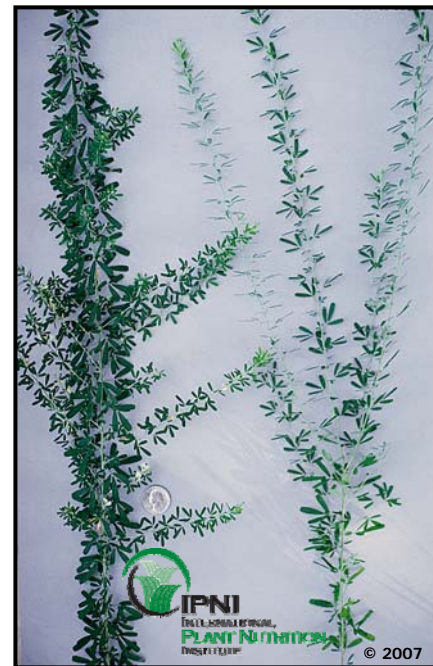
Sericea Lespedeza ( Lespedeza cuneata )

Sericea can provide moderate-quality forage; however, as the plant matures, the stems become taller, highly lignified and very woody. Late maturity will result in very poor forage quality that most animals will increasingly avoid. Therefore, sericea should be managed to keep the plants growing vigorously. Grazing should begin when plants are eight to 15 inches tall and should not be grazed closer than