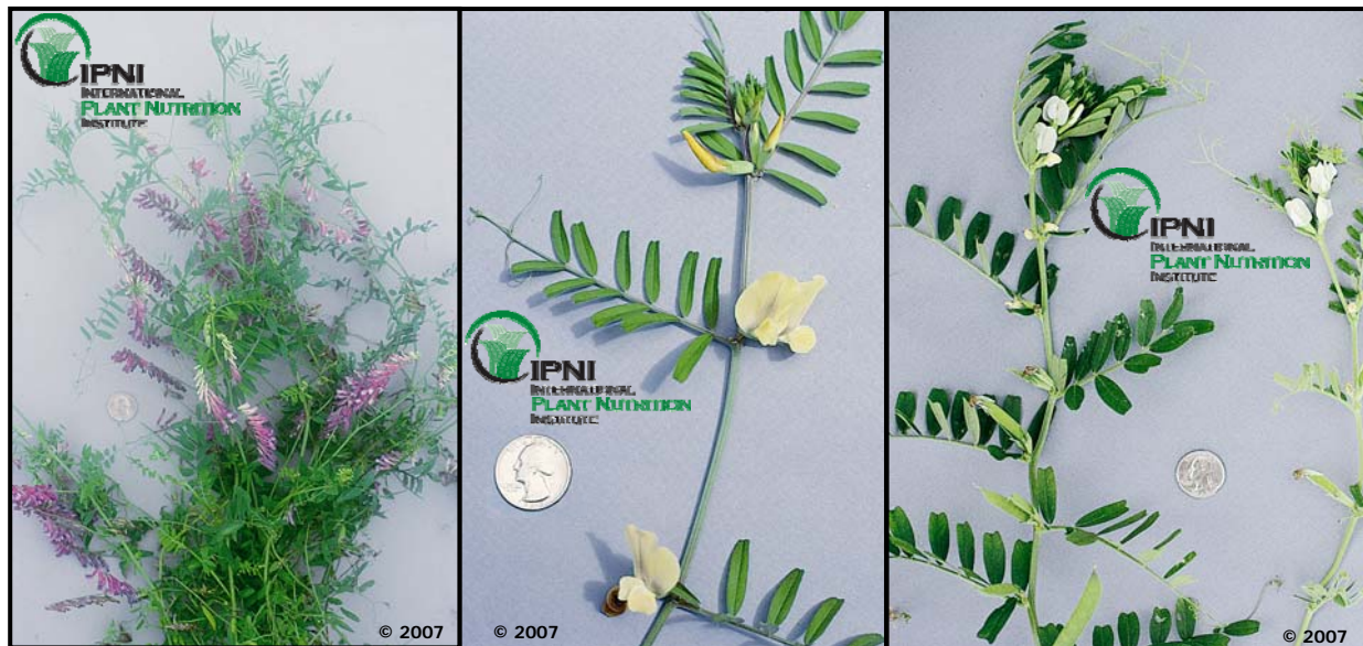
Hairy Vetch ( Vicia villosa )

Hairy and common vetch mature later in spring than crimson clover, but are cold-hardy, more tolerant of low soil pH than most clovers, and have a low bloat potential. Some common vetch varieties have been developed that are resistant to root-knot nematodes.