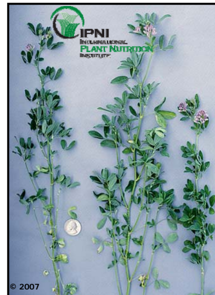
Alfalfa ( Medicago sativa )

For monoculture stands, it is best to seed alfalfa on a well-prepared, firm seedbed. On prepared land, plowing and disking operations should be done as needed to incorporate pre-plant applications of lime and fertilizer and to ensure a good, firm seedbed. A preemergence application of a labeled herbicide such as EPTC (Eptam) or benefin (Balan) is desirable (for currently labeled herbicides, see the Georgia Pest Management Handbook at http://www.ent.uga.edu/pmh/ ). Alfalfa may be seeded with a cultipacker-seeder (best) or a grain