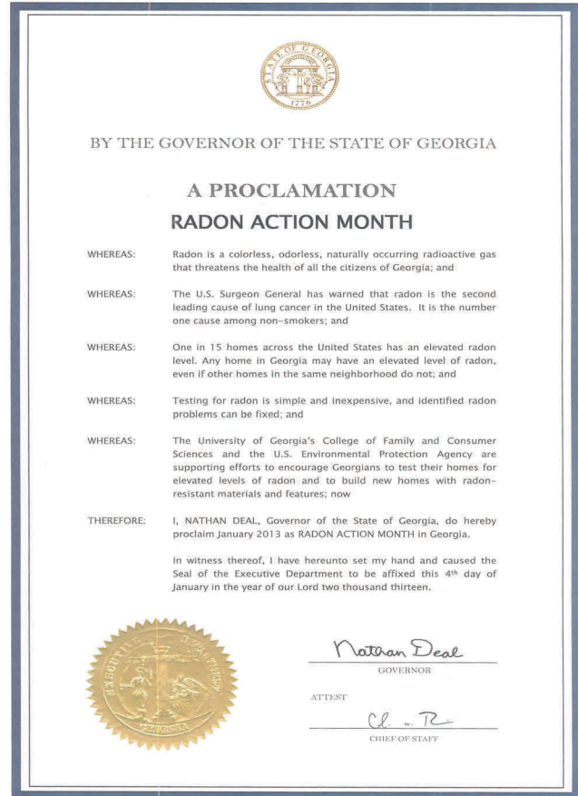
Above: The Georgia Radon Action Month Proclamation