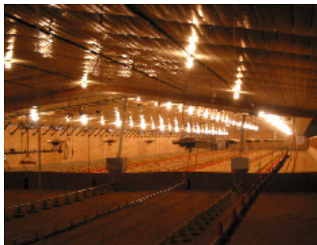
Figure 5. Higher light intensities during brooding will encourage chick activity. The increase activity will help chicks find feed and water sources thus getting them off to a good start.

Ventilation is needed to regulate temperature and remove carbon dioxide, ammonia, other gases, moisture, dust and odors. Fresh air must be introduced uniformly, mixed well with house air, and circulated properly throughout the house. The flow pattern within the building is very important. Air movement into the house is accomplished via negative pressure. Fans remove air from the house creating a negative pressure. Air enters through inlets located in the walls or ceiling