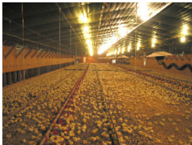
Figure 2. When adequate house temperature is obtained and chicks are well managed, they should be distributed throughout the house and not huddling together or sitting mostly in the feed pans.

Proper brooding not only consists of maintaining proper temperature but also the use of good husbandry practices. Brooding temperatures will vary depending on whether the heat source is air furnace, conventional brooder or radiant brooder (Table 1). Note that the