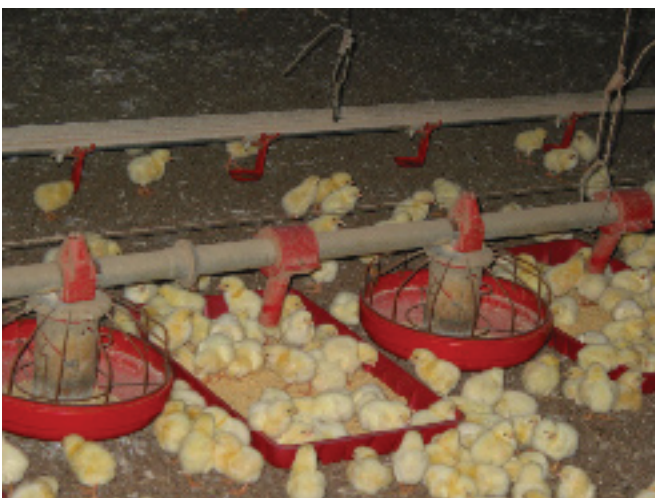
Figure 1. Managing the house and chick correctly during the brooding period will get chicks off to a good start.

Research has shown chicks that are subjected to cold temperature have impaired immune and digestive systems. As a result, cold stressed chicks have reduced growth and increased susceptibility to diseases.