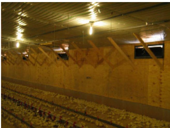
Figure 4. Air entering through the inlets is directed along the ceiling. This allows the air to warm up to brooding temperature before coming into contact with the chicks. This also increases the moisture holding capacity of the air so that when the warm air does fall down to chick level it will pick up and hold more moisture from the litter, helping maintain litter conditions in the house.

lation increases, more ammonia is generated from nitrogen sources found in bird fecal material. Ammonia is a gas that has a negative impact on bird health and performance. Research shows that increased ammonia impairs the immune system and increases respiratory disease in birds. High ammonia levels during brooding reduces growth rate, which is not gained back during the remainder of the growout. Ammonia production can be reduced through the control of relative humidity which in turn is regulated by ventilation. A relative humidity level of 50 to 70 percent is recommended to minimize ammonia production and dust.