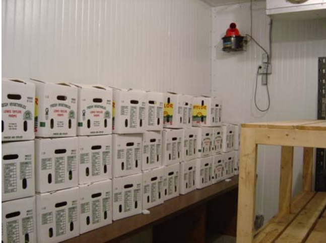
Figure 1. Pepper and eggplant boxes stored in cold storage.