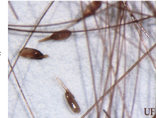
Figure 2: Nits (lice eggs)

The nits are generally near the scalp, but they may be found anywhere on the hair shaft.