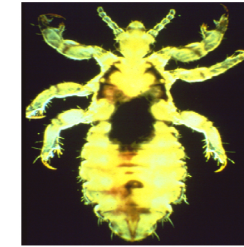
Figure 1: Head Louse

• The best treatment for head lice is manual removal. Encourage parents and school nurses to follow thorough manual removal techniques as a first step. See "10 Tips for Manual Removal" in this brochure.