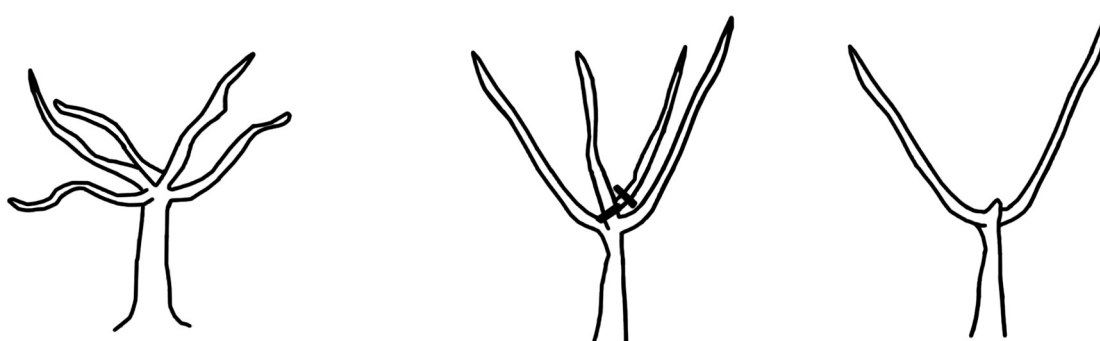
Figure 1. Open Center System (left); Perpendicular-V System before and after pruning cuts.