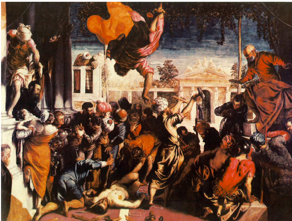
Jacopo Tintoretto, St. Mark Rescuing a Slave. 1548. Venice, Accademia.