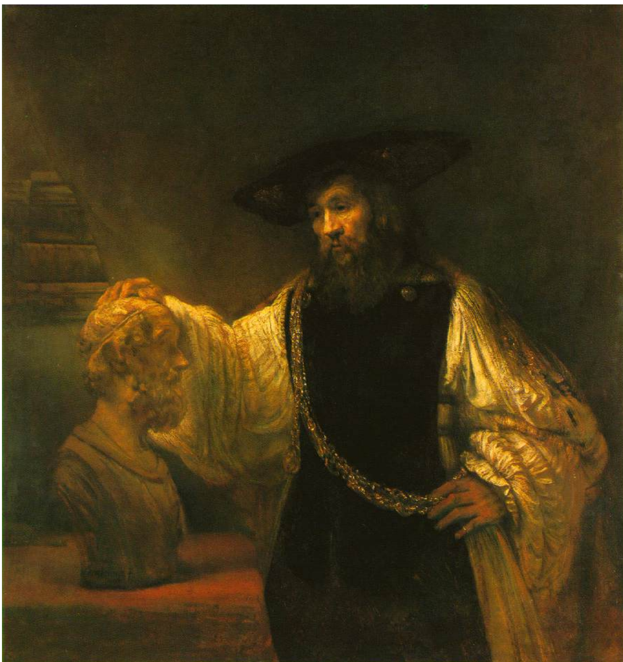
Rembrandt van Rijn, Aristotle Contemplating the Bust of Homer. 1653. Metropolitan Museum of Art, New York