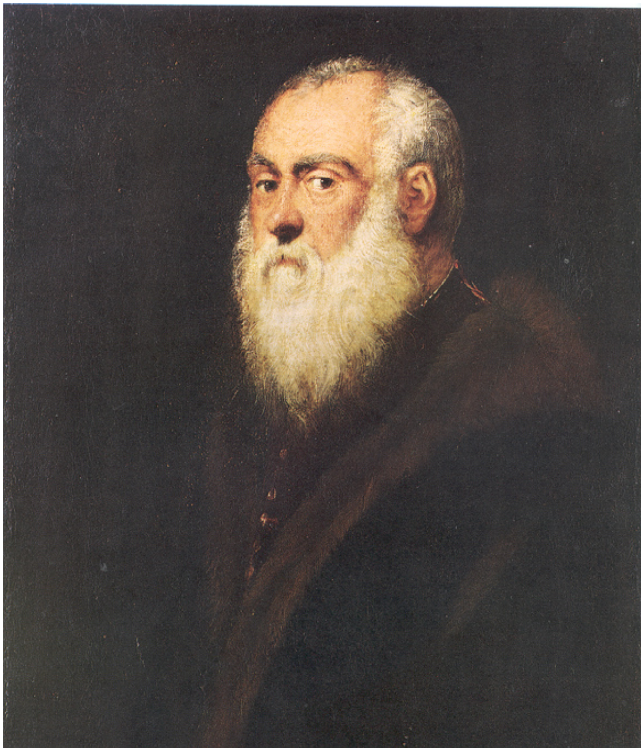
Jacopo Tintoretto, Ritratto di vecchio con pelliccia, intero e particolare. Vienna, Kunsthistorisches Museum