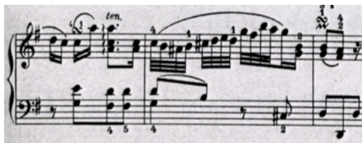
Example 1: Sonata 1, movement 1, m. 6-7

The first movement tempo marking, Un poco andante , which means “a little slow,” is significant. The words un poco are probably added to make a contrast with the second movement’s tempo marking of Adagio , which means “very slow.” To make the contrast in tempo between the first and second movements the first movement should not start too slow. Rather, the performer should choose a speed at which the thirty-second-note passages in mm. 4, 7, and 31 flow comfortably. (See Example 1.) A metronome mark between 88 and 96 to the eighth note is suggested.