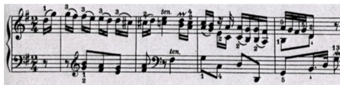
Example 2: Sonata 1, movement 1, mm. 1-4

In the first phrase, it can be helpful for students to make a skeleton of the phrase structure using three main notes: G (the downbeat of m. 1); E (m. 2, marked tenuto ), and D (the last note of the phrase, m. 4). Those three main notes form the outline of the first phrase. (See Example 2.)