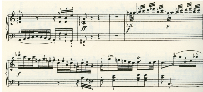
Example 13: Sonata 6, movement 1, mm. 76-82