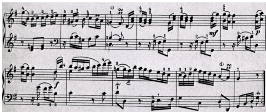
Example 3: Sonata 1, movement 1, mm. 22-32

The first movement starts with an accompanied solo melody line in mm. 1-2 that changes to harmonic thirds in mm. 2-3 and then to harmonic sixths in m. 3. (See Example 2, p. 12.) The opening phrase is developed throughout the B section (mm. 17-32). In mm. 25-28, the harmonic intervals expand from thirds to sixths as they approach a climax. An unexpected decrease in dynamics occurs at the end of m. 27, just before the climax. At the summit of the climax at the end of m. 28, the melody dramatically returns as a forte solo line.