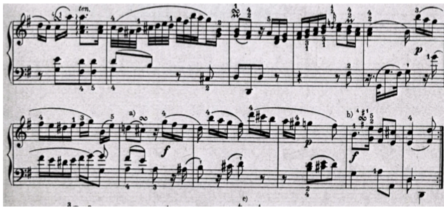
Example 4: Sonata 1, movement 1, mm. 6-16