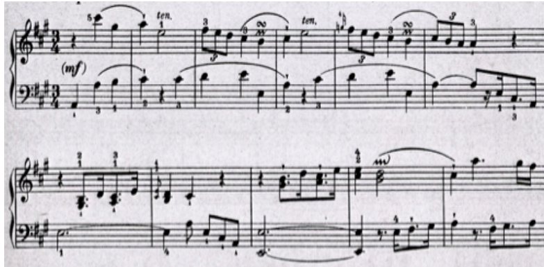
Example 9: Sonata 2, movement 1, mm. 1-11

For my graduate assistantship assignment, I have accompanied ballet classes and consequently observed many dancers. In my opinion, if this movement were to be danced, the dancers would make a movement that looks like a curtsy, and making this motion naturally takes a bit more time. On the second beats the tenuto markings are possibly there to give the dancers enough time to execute the motion gracefully.