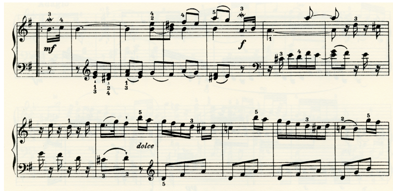
Example 8: Sonata 1, movement 3, mm. 17-28

and duple meter. This is a good opportunity for the student to experience hemiola, although not every student will be ready to understand the intellectual concept. (See Example 8.)