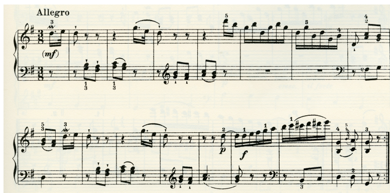
Example 7: Sonata 1, movement 3, mm. 1-16

Only one passage, mm. 13-14, could be puzzling in terms of articulation. At the end of this scale passage, a slur is placed over the last five notes. The slur seems to imply a more connected touch for these five notes than the notes preceding them. However, it is difficult to precisely define the “correct” way to play scale passages notated without slurs in Classical era performance practice. Two options are available: play the whole passage legato or play the unslurred notes with a lighter touch but do not attempt a completely staccato touch. (See Example 7.) The sixteenth-note passagework marked dolce (mm. 25-32) invites a legato touch. (See Example 8, p. 18.)