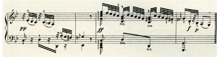
Example 6: Sonata 1, movement 2, mm. 25-28

means the dynamic gradually increases. Measure 23 contains three different dynamic markings. On the downbeat of m. 27 an explosive event occurs when the thickest chord (eight notes) in the sonata is played ff , the only request for this volume level in the entire sonata. (See Example 6.)