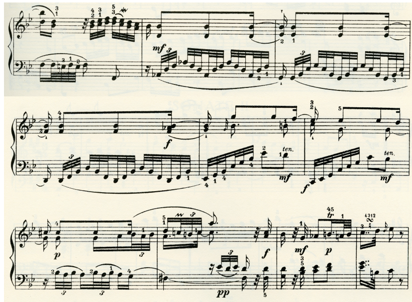
Example 5: Sonata 1, movement 2, mm. 15-24

In contrast to the first and third movements, this movement is through-composed, giving the listener the impression of an improvisation. However, Hässler planned his structure carefully. For instance, from mm. 16-22 the bass line moves as follows: A b – G – D (F is included in the harmony)- E b – D – C –B b – A – G – F # . This long, mostly stepwise, bass line supports chordal, three-part chorale, and polyphonic writing within the span of seven measures, providing a fine example of Hässler disguising his organizational skill when writing in an improvisational style. (See Example 5.)