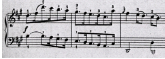
Example 10: Sonata 2, movement 1, mm. 62-64

A performance practice issue relating to rhythm arises in m. 52. The dotted rhythm of the left hand part should be played with the third note of each triplet in the right hand part. Sandra Rosenblum discussed this baroque era notation: