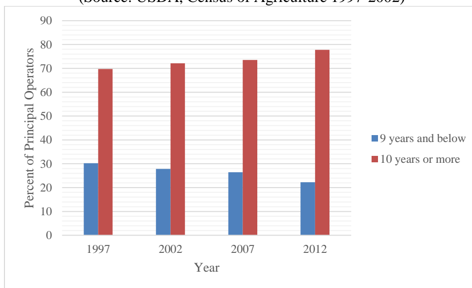
Figure 2. Share of Beginning and Mature Farms (Source: USDA, Census of Agriculture 1997-2002)