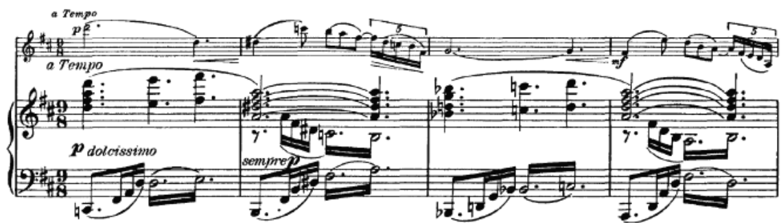
Example 2. Ottorino Respighi, Violin Sonata in B Minor, First Movement, mm. 84-87.

The influence of Respighi's own recent orchestral works in the B-Minor Sonata can be perceived in a variety of ways. Flamm emphasizes its formal connection to Sinfonia drammatica by its use of motives connecting the movements. However, the sonata's link to Respighi's orchestral writing comes mainly from the sonority of the work itself, achieved through thick multilayered textures in the piano as well as extreme registers and gestures evocative of orchestral music. One example is the persistent use of tremolos in the low register of the piano (Example 2).