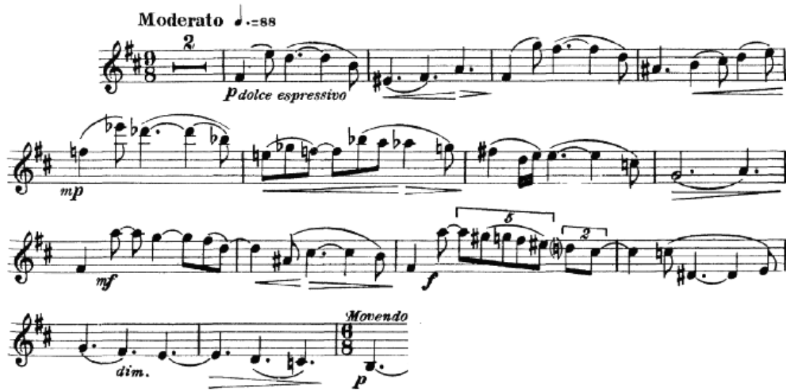
Example 1. Ottorino Respighi, Violin Sonata in B Minor, First Movement, mm. 1-17.

Although the predominant style of the B-Minor Sonata can be described as Romantic, it is well differentiated from that of his earlier chamber works. Its highly chromatic quality can be heard from the onset of the primary theme, with a rather early half-step modulation down to B-flat Minor and a melody full of chromatic tones and dissonant intervals.