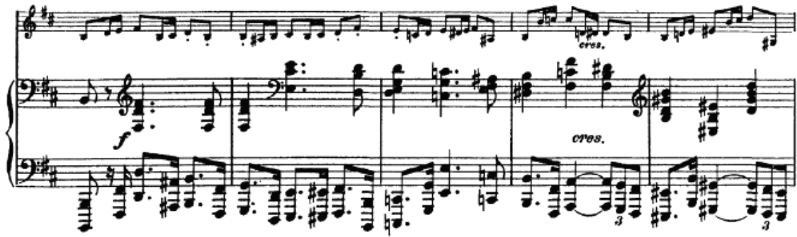
Example 6. Ottorino Respighi, Violin Sonata in B Minor, Third Movement, mm. 21-25.

Moreover, the melodic shape of the bass theme resembles that of many keyboard passacaglias from the Baroque period, such as Bach's Passacaglia in C Minor, BWV 582.