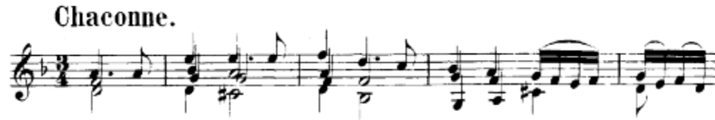
Example 5. J. S. Bach, Partita for Solo Violin in D Minor, Chaconne, mm. 1-5.

meter, the characteristic rhythm, and the emphasis on the second beat. This can be heard already in the third measure of the bass theme as well as in the violin theme at m. 11 and the countermelody in the right hand of the piano in Variation I (Example 6).