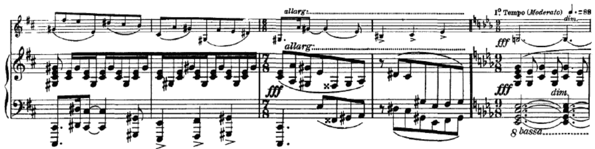
Example 7. Ottorino Respighi, Violin Sonata in B Minor, First Movement, mm. 142-146.

The thick texture of the piano part occasionally poses ensemble challenges. The piano should always be sensitive during long crescendos that lead into violin entrances so as not to cover the violin. The violin, on the other hand, should always be aware of the moving notes in the piano part, especially when they are not strictly accompanimental and when the passage does not allow for rubato such as at the end of the coda, mm. 249-256. In regard to multiple subdivisions of the beat, e.g. mm. 140-145, the septuplets can be played with some freedom as long as the two instruments line up on each downbeat. This suggestion is also valid for any part of the sonata where the piano has subdivisions of 7, 11, and 14. However, at the allargando of mm. 144-145 in the first movement, the two parts should be stretched evenly and avoid lining up until the downbeat of m. 146.