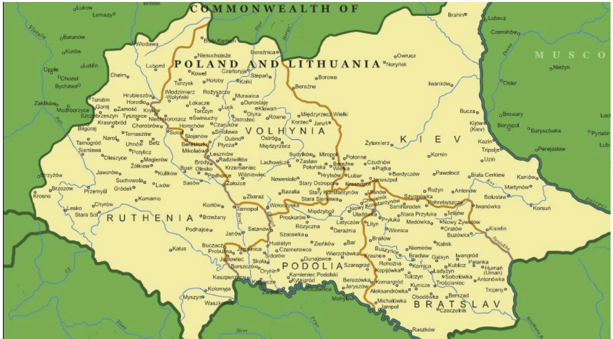
Communities where Jews were killed by the Gzeyres Takh Vetat, or Cossack Uprising and Tatar attacks of 1648-1649.