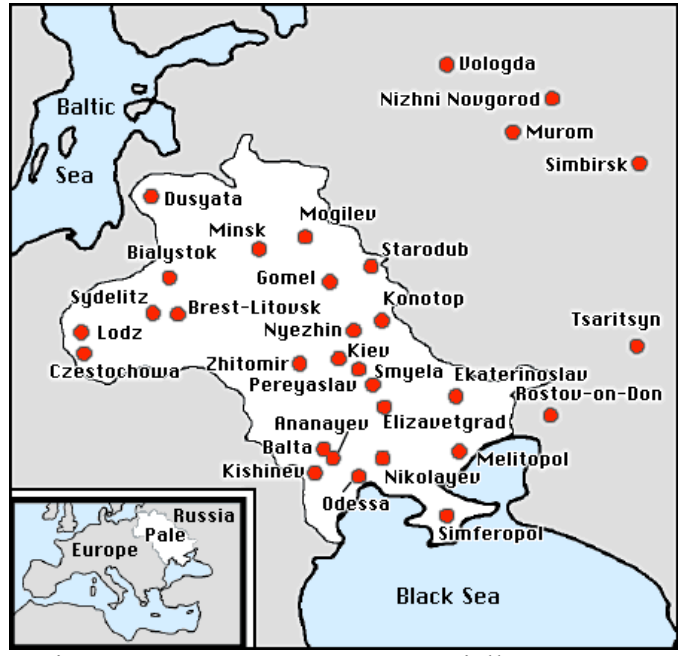
Russian/Polish/Lithuanian Pogroms, 1871-1906. Especially gruesome to note is Kishinev in 1903 (now capital of Moldova).