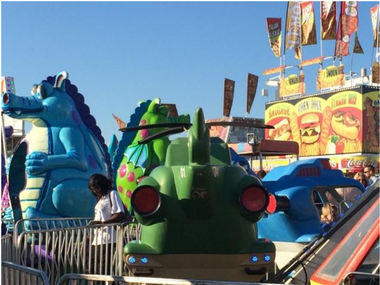
Figure 8. The midway on opening day at the County Fair. 2015.

reputation. As she walks through the display, she stops and snaps photos of the artwork. Suddenly, she turns towards me and smiles. She would be so much easier to envy if she weren't so darned nice.