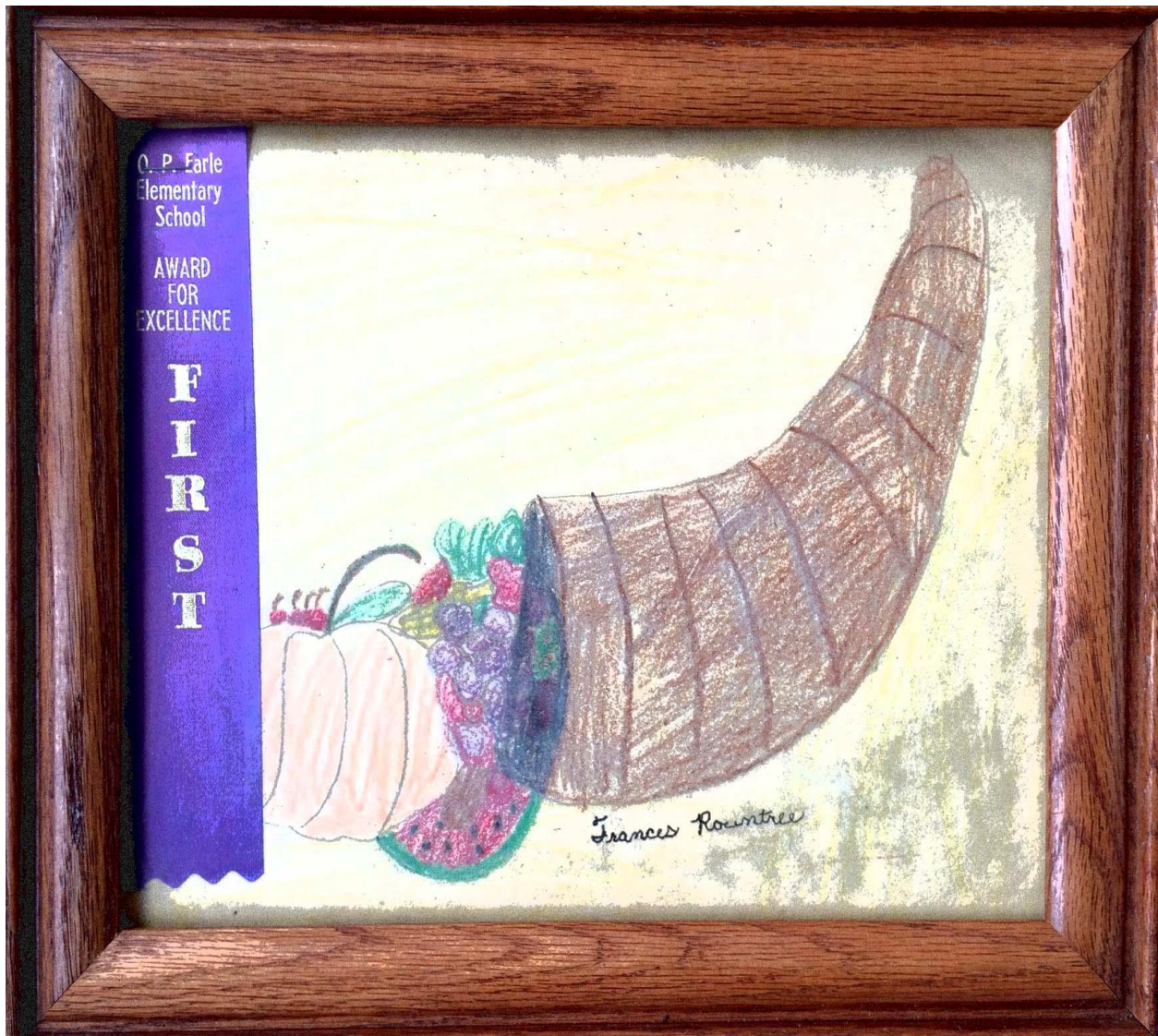
Figure 1. Drawing of a cornucopia. Frances Rountree (Vaughan). 1985. Crayon.