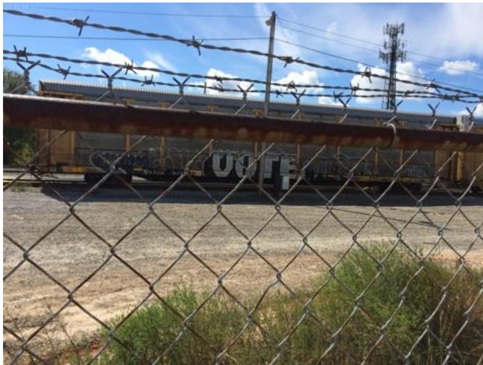
Figure 5. View from inside the fairgrounds. 2015.

The road to the county fair winds down a shaded, old, neighborhood where many of the houses are in disrepair. There is an abandoned bar, a small gas station, and a tunnel leading under a set of railroad tracks laden with graffiti. The 45-acre lot is surrounded by a chain link fence with barbed wire along the top.