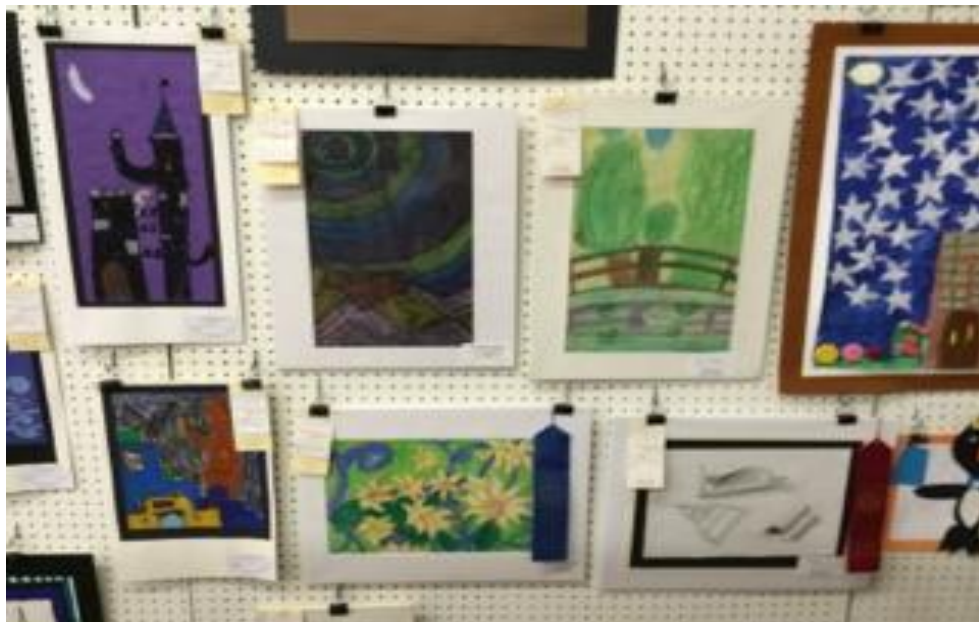
Figure 7. The County Fair art competition display. 2015.

As the County Fair art exhibit superintendent, Brenda was passionate about the competition remaining a community event meant to celebrate children's artistic endeavors. As a result, every artwork entered is put on display creating a floor to ceiling collage of works with scarcely an inch of space in between.