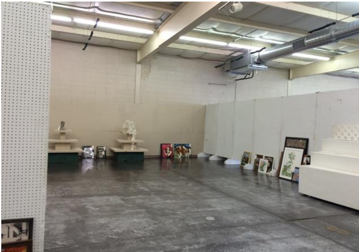
Figure 6. Setting up the competition. 2015.

left of the midway stands a concrete building with an aluminum walkway leading up to a thick, metal door. Inside, there are two, long tables and four, brown folding chairs. A woman in what looks to be her early fifties sits at one of the tables. Another female sits at a table across from her, white papers folded over each other and spread out in front of her. An elderly gentleman is gently placing stacks of artwork at the bottom of pegboard walls set up inside the building.