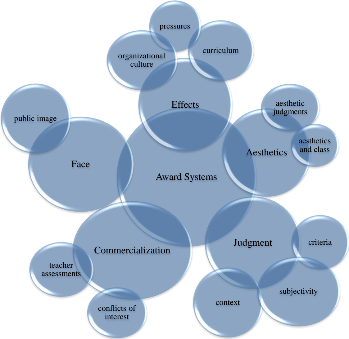
Figure 2. Visual representation of literature review themes.

questions to create codes. The codes were systematically sorted and organized using word processing software into emergent themes, or findings (Saldaña, 2012). These include: the aesthetic element, judgment, the commercialization of education, saving face, and the effects of award systems.