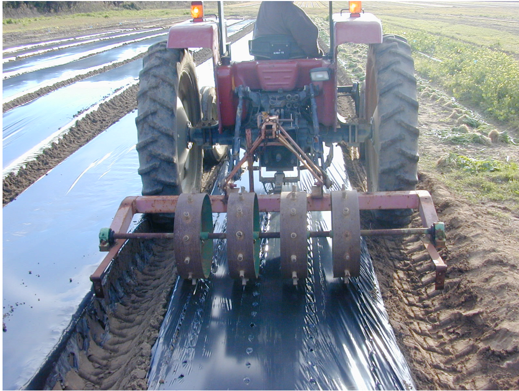
Figure 1. Pegging plastic covered beds. Note the planted onions on the right, which were regularly hand weeded and the weed pressure directly to their right along the irrigation row. This highlights the importance of weed control. Additionally these beds are approximately 4 ft. across the top to facilitate the use of the pegger resulting in a plant population comparable to conventional onions.