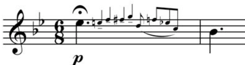
Figure 6.25: Mozzafiato