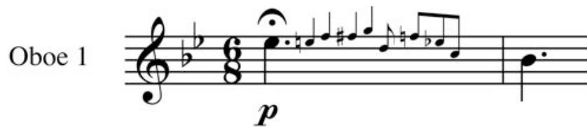
Figure 6.21: Octet, II: m. 55

Aside from the grace notes, there are still two brief eingang that must be addressed in the second movement. Surprisingly, this is the area where the most liberties have been taken. Figure 6.21 shows the oboe part as written by Beethoven: