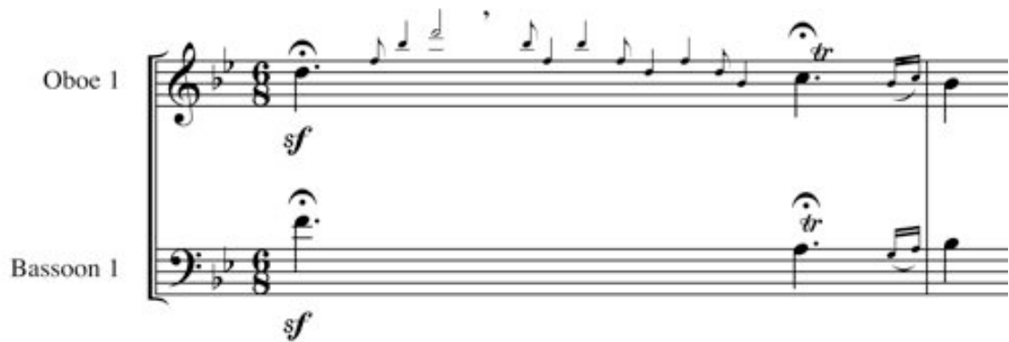
Figure 6.31: Consortium Classicum