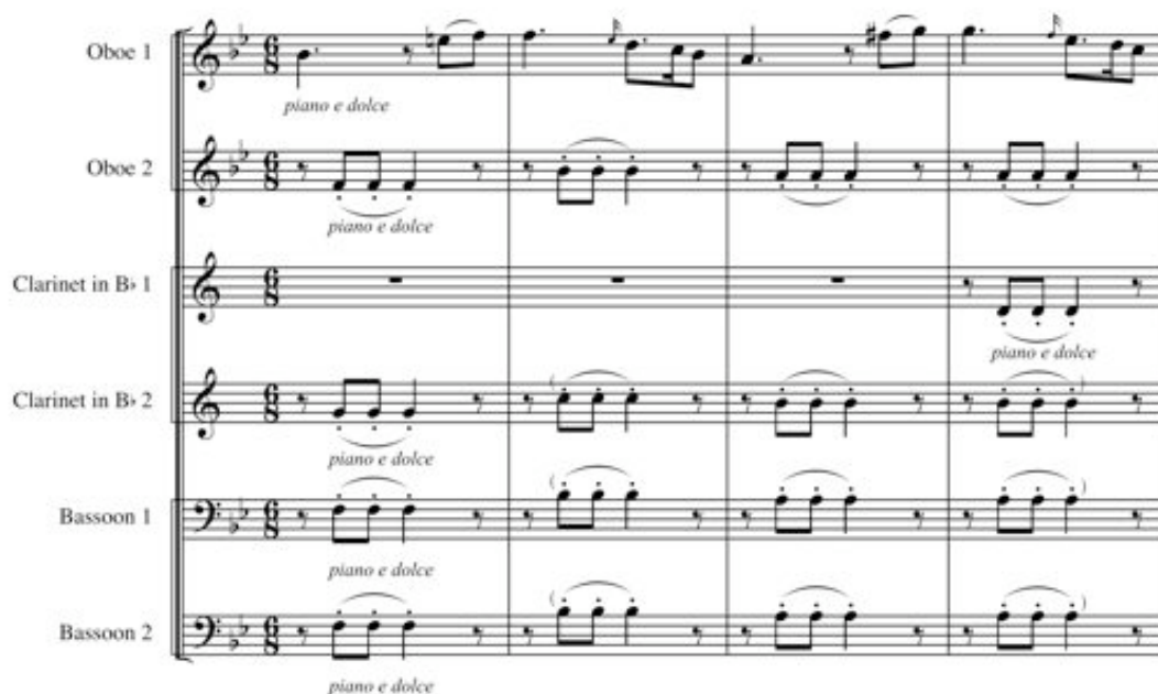
Figure 6.20: Octet, II, mm. 1-4

Is the grace note an appoggiatura—placed on the beat—or should it occur before the beat, similar to modern day notation? An analysis of the Octet and Quintet recordings reveals two distinct approaches to grace note placement. Specifically regarding Beethoven, Grove Music Online concludes that “Beethoven's practice illustrates this changing attitude; he very rarely used small notes to indicate appoggiaturas (except in vocal music), reserving them principally for grace notes.” There are two points that leave these grace notes up to interpretation. First, the Octet and Quintet deal with early Beethoven. Second, the vocal/duet nature of this movement may lead the performer to play the grace notes on the beat with a slight emphasis as a vocalist would sing them. Both approaches can be justified and an analysis of the Octet and Quintet recordings confirms this. Out of the nine Octet recordings, 171 only two groups treat it as an appoggiatura. The other seven