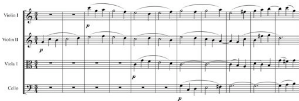
Figure 4.25: K406/516b, III, Trio in canone al rovescio: mm. 1-11

The added second trio—the last change to the Quintet’s third movement—initially stands out in terms of length. Beethoven composed a total of 90 additional measures, increasing the overall length of the movement by 100 percent (when compared to the Minuet and Trio of the Octet). The relationship to a possible string quartet commission has already been mentioned, but Sabine Kurth and Douglas Johnson believe that there is yet another connection to a string quartet. Both see an “obvious closeness” between the Quintet’s second trio and Mozart’s K388 and K406/516b’s “Trio in canone [al rovescio]” (see Figures 4.25 and 4.26). 124