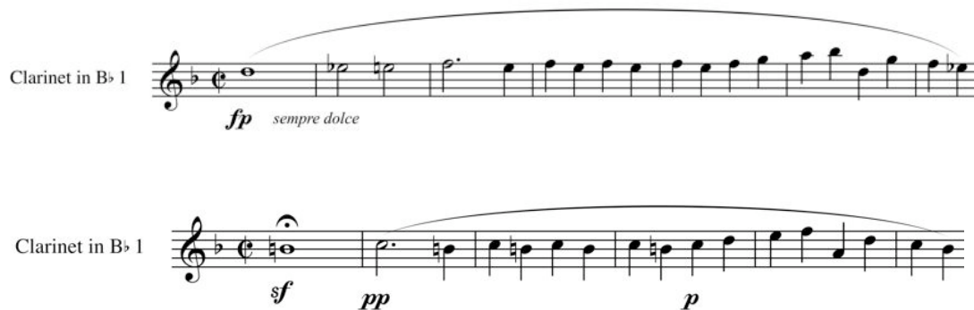
Figure 6.35: Octet, IV: mm. 91-96 and mm. 198-202

Aside from tempo, the fourth has three areas subject to interpretation: the clarinet transitions in measures 91 (see Figure 6.35) and 199 (see Figure 6.36), and the last note of the work.