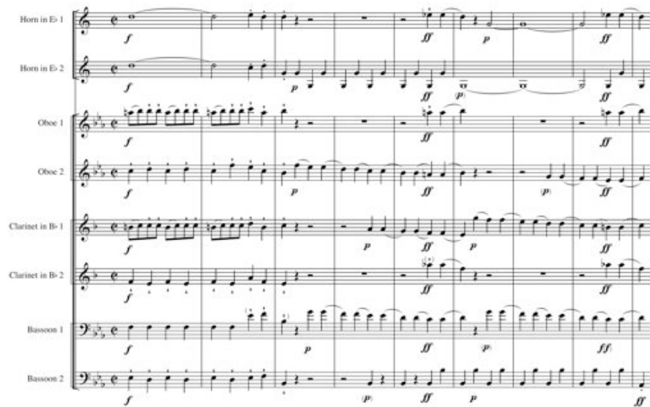
Figure 6.2: Octet, IV: mm. 42-49

The horns and bassoons are often used in this manner while the oboe and clarinet either carry the melody or have this type of melodic exchange. Even when the first bassoon takes the helm, the second bassoon continues to be a vital element of the movement's rhythmic integrity. Placing the horns and bassoons in the middle of the ensemble is a straightforward decision, but in what order? Initially the author believed the following setup was the most practical (left to right): horn I, horn II, bassoon, II, bassoon I, but the balance and communication of the ensemble was never as solid as it needed to be. The following setup worked best for all of the performers (as well as the audience):