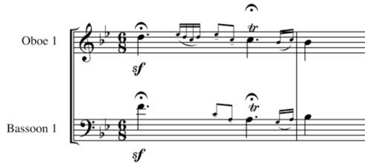
Figure 6.29: Mozzafiato

bassoon were meant to work as one when playing this passage. The next two groups are the Netherlands Wind Ensemble and Mozzafiato. Both add a turn in the oboe after the first note but each approaches the trill differently (see Figures 6.29 and 6.30). It should be noted that Mozzafiato's version starts the trill on the upper note. 176