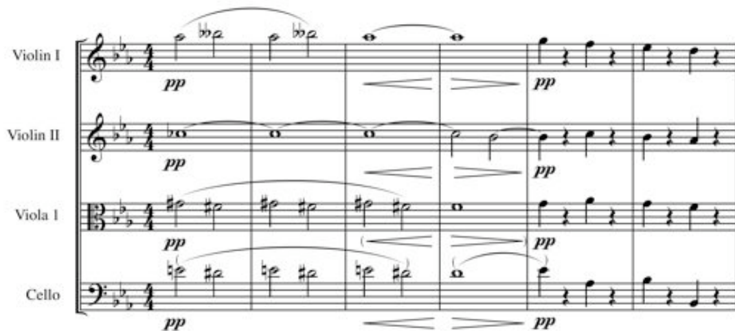
Figure 3.1: Quintet, I: mm. 159-164

According to Douglas Johnson, “colorful modulation had become something of an obsession between 1793 and 1795,” and Beethoven was certainly experimenting in his rearrangement of the Octet. 104