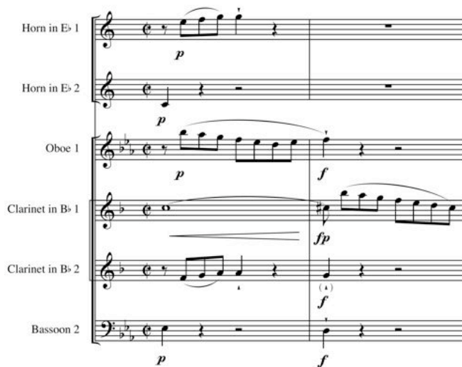
Figure 6.9: Octet, I: mm. 93-94

Not only do the quarter notes tend to rush but also the lyricism found in the oboe line (measure 89) is often played with rubato , the latter creating a possible issue with the first bassoon and second clarinet. This figure is repeated five measures later (see Figure 6.9) in the clarinet without the accompaniment, allowing the performer much more room to shape the line (and not worry about lining up with the accompaniment).