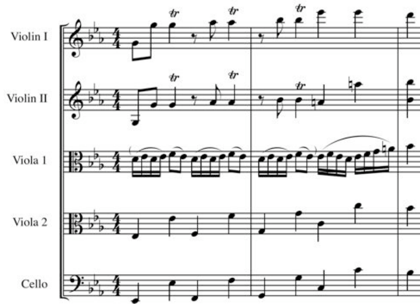
Figure 4.3: Quintet, I: mm. 26-27

Up to this point, the primary tonal and structural material is the same in both pieces—Beethoven remains fairly loyal to the original. Measure 28, however, marks the point in the Quintet where Beethoven reveals that the “arrangement” might be much more than a reorchestration with minor edits. Beethoven shows his willingness to change by repeating the first two measures of this transition, making a four measure phrase now six. He also creates variety by passing the melody between the violins and first viola—the Octet repeats the melody in the oboe—and lowering the figure an octave with each reiteration. It should be noted that this particular transition also marks the first tonal shift between the two works; Beethoven changes the closing material of the first theme from G minor in the Octet to C minor in the Quintet (he also adds a number of passing chords to the texture). The Octet changes harmonically every two beats, but the Quintet presents a more active progression led by a series of suspensions (see Figures 4.4a and 4.4b).