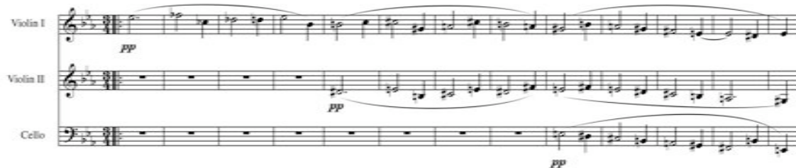
Figure 3.3: Quintet, III, Trio II: mm. 25-37

In the first movement, the V chord that precedes the central thematic return is complicated by a surprising chromatic detour. The complications increase in the second movement, where the retransition involves a related chromatic detour that is even more daring and that almost complexly envelops the V that precedes the recapitulation. And in Trio II of the third movement, matters intensify yet again, as the chromatic elements seen in the retransitions of the first two movements now assert themselves on the deepest levels of structure. It is only in the finale that the chromatic trickery... is set aside. 107