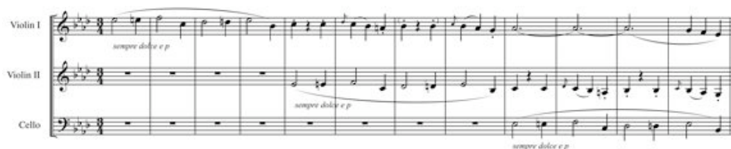
Figure 4.26: Quintet, III, Trio II, mm. 1-12