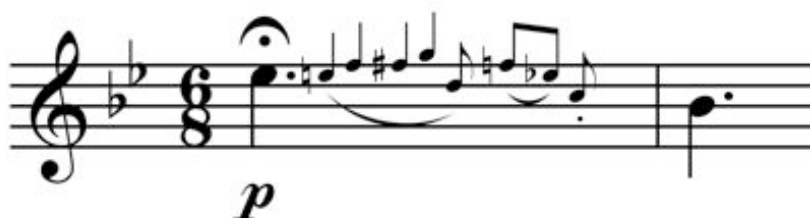
Figure 6.26: The Netherlands Wind Ensemble

All six of these variations provide a different feel and flow to this transition. Some ensembles focus on connecting the entire line to the next measure while others use their