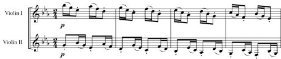
Figure 4.36a: Quintet, IV: mm. 359-362