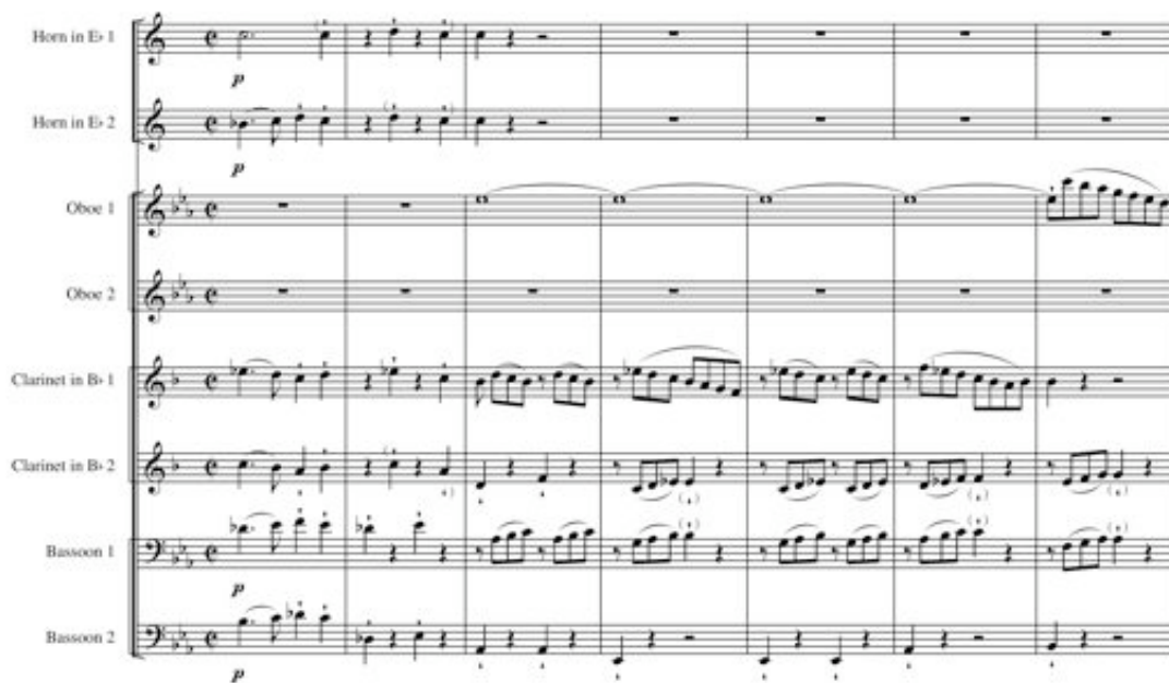
Figure 6.8: Octet, I: mm. 83-90

Not only do the quarter notes tend to rush but also the lyricism found in the oboe line (measure 89) is often played with rubato , the latter creating a possible issue with the first bassoon and second clarinet. This figure is repeated five measures later (see Figure 6.9) in the clarinet without the accompaniment, allowing the performer much more room to shape the line (and not worry about lining up with the accompaniment).