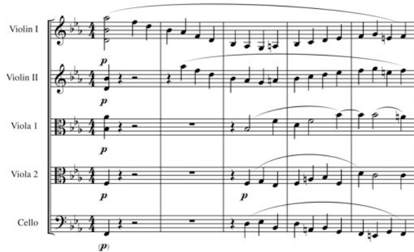
Figure 4.8b: Quintet, I: mm. 53-57