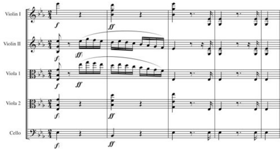
Figure 4.37: Quintet, IV: mm. 415-419

the Octet, as Burstein believes, simply a draft of the Quintet or, according to Johnson, is the Quintet a less sophisticated piece of music, “turning the Slim Bonn lady into a Viennese vamp?” 128