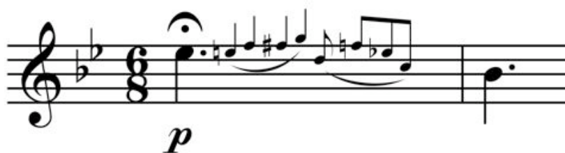
Figure 6.23: Czech Philharmonic