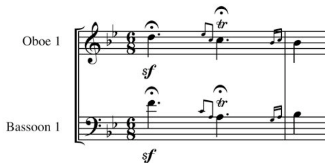
Figure 6.28: Octet, II: mm. 107-108

Measure 55 is not the only instance where ensembles have changed Beethoven's transitions, however. Amazingly, out of the nine analyzed Octet recordings only four ensembles perform the first oboe and first bassoon parts in measure 107 as written (see Figure 6.28). 175