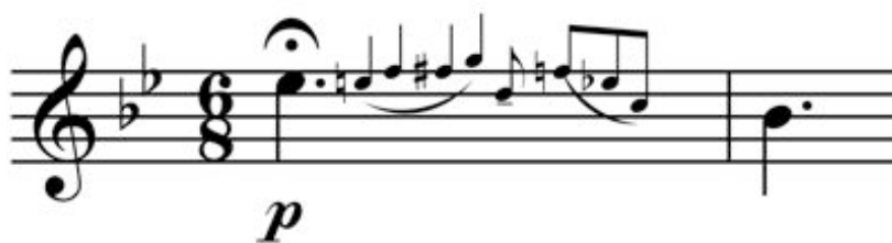
Figure 6.24: Bläser der Berlin Philharmoniker