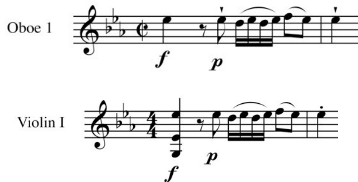
Figure 4.1: Octet and Quintet, I: measure 1

According to the Oxford Music Online , the music of Beethoven is heard “at the level of the motif rather than the theme.” The opening motive, first heard in the oboe and violin in the Octet and Quintet, respectively, is a simple two-beat fragment (see Figure 4.1).