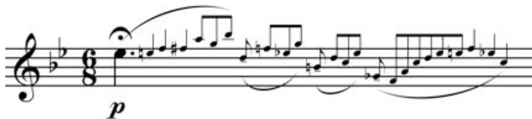
Figure 6.27: Kammerharmonie Bläuersolisten

respective articulations to return to the movement's 6/8 feel. On the other hand, the ninth and final ensemble analyzed—the Kammerharmonie Bläuersolisten der Staatskapelle Dresden—uses a great deal of creative license on this passage. The ensemble interprets the fermata to signal the opportunity for improvisation. Despite the length of Kammerharmonie's added material, the dominant prolongation shown in Figure 6.21 (the E-flat functions as the seventh of the dominant) should not be considered a cadenza. 172 This ornamentation surrounding the dominant is common to the Classical period eingang , a transitory passage that is—according to Oxford Music Online—often signaled by a fermata when the composer wishes the performer to add an improvisatory element. The Kammerharmonie Bläuersolisten, however, chooses both the written material and performer option, bookending a newly created passage with Beethoven's original line. This aligns with the research of Brown and Sadie: the eingang —signaled by a fermata and sometimes referred to as a “lead-in”—is often found before the restatement of the principal theme in fast and slow movements. 173 The changes are so significant that it provides the listener with something entirely new and unexpected (see Figure 6.27).