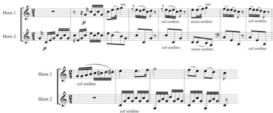
Figure 2.3: Rondo, mm. 107-114 / 118-121

The use of this mute and the stronger emphasis on chromaticism certainly sets the Rondo’s horn lines apart from those of the Octet. A final—and perhaps more important—difference is the extensive melodic focus that Beethoven places on the instrument throughout the Rondo (see Figure 2.3). The figure below illustrates Beethoven’s use of the mute for the echo effect, matching exactly what would be expected from horn virtuosi at the end of the eighteenth century.