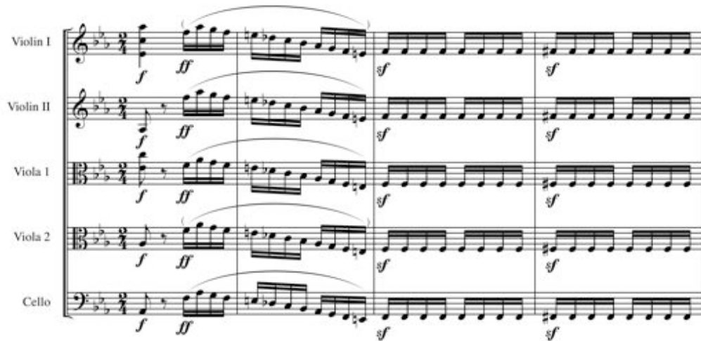
Figure 4.30: Quintet, IV: mm. 130-133

From this point the Octet goes on to use previously heard material. The Quintet, however, takes a fresh approach, bouncing the motivic material around from instrument to instrument much like the first movement. Remnants of the Octet can be found throughout the Quintet in less obvious areas (see Figures 4.31a and 4.31b). The oboes/violins and bassoon/violas may have similar material, but once again Beethoven spins a simple phrase from the Octet into something almost entirely new. It appears that he is picking and choosing portions of the Octet and placing them wherever he likes. The segment of the Octet below appears in the “B” section, but Beethoven chooses not to insert it until the “C” section of the Quintet—structurally many bars later.