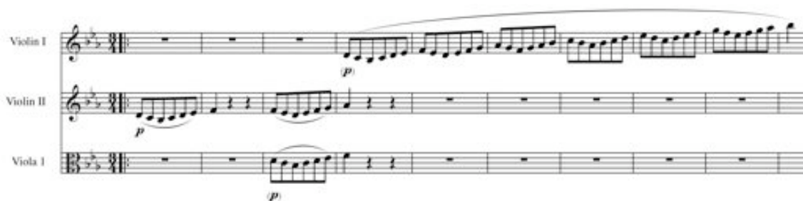
Figure 4.24b: Quintet, III, Trio I: mm. 25-34

The added second trio—the last change to the Quintet’s third movement—initially stands out in terms of length. Beethoven composed a total of 90 additional measures, increasing the overall length of the movement by 100 percent (when compared to the Minuet and Trio of the Octet). The relationship to a possible string quartet commission has already been mentioned, but Sabine Kurth and Douglas Johnson believe that there is yet another connection to a string quartet. Both see an “obvious closeness” between the Quintet’s second trio and Mozart’s K388 and K406/516b’s “Trio in canone [al rovescio]” (see Figures 4.25 and 4.26). 124