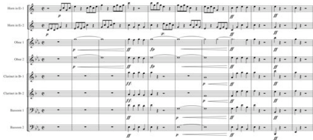
Figure 4.34: Octet, IV: mm. 213-223