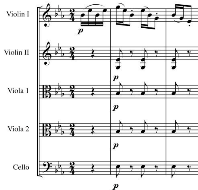
Figure 4.28: Quintet, IV: mm. 1-2

In keeping with the previous movements, the Quintet's finale is longer than the Octet's, once again largely due to sequencing and repetition. Unlike the first movement, however, Beethoven introduces new material into the Quintet rather quickly. Where it took Beethoven nearly thirty measures to create a structural difference between the first movements, he only needed ten in the finale. The "A" theme of the Quintet is interrupted by eight measures of newly composed material (and, unlike the Octet, the Quintet states the "A" theme a second time). The Octet and Quintet now differ by eighteen measures after only a single phrase. This, along with other newly composed material, adds almost 200 measures to the Quintet's finale, increasing the Octet finale's original length by 88 percent. Figure 4.29 displays one instance of both sequencing and repetition through one example of new material in the Quintet: