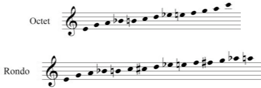
Figure 2.2: Octet and Rondo: E-flat horn ranges from E 4 and up (transposed)

One can certainly argue against his opinion of the clarinet's role in the Octet; the finale alone is evidence that the instrument holds a more important position than Abraham suggests. Regarding the horn writing, Beethoven does place a slightly higher emphasis in the Rondo on chromaticism achieved through hand-stopping: C-sharp, F-sharp, and A-flat are not found in the Octet (although the first horn's range is a minor third higher). Figure 2.2 displays the E-flat horn ranges from the first, third, and fourth movements: 51