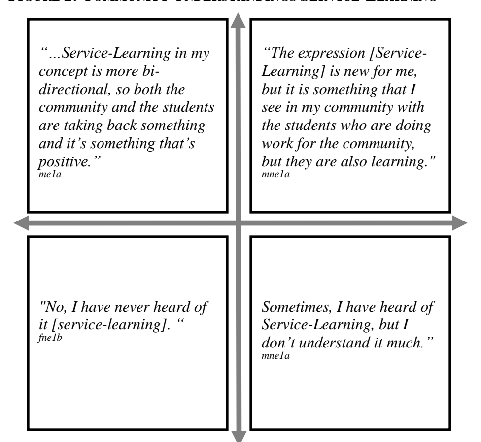
FIGURE 2: COMMUNITY UNDERSTANDINGS SERVICE-LEARNING