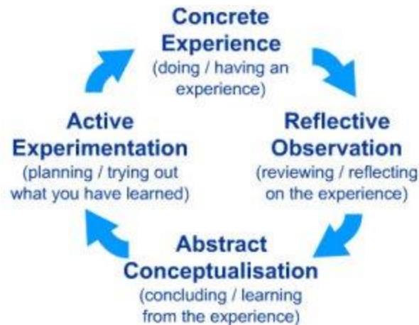
Figure 1: Kolb's Theory of Experiential Learning

with their seeds and overwater or underwater them, and then reflect on what occurred. Then the experiential learning process begins again and students have now gained something from the experience.