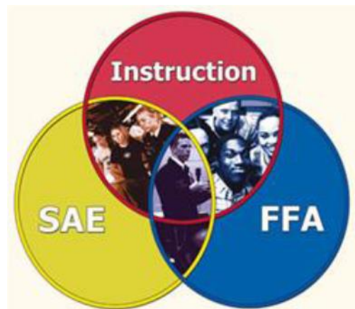
Figure 2: Three-Ring Model of Agricultural Education

on a recommendation by the National Research Council in 1988 to the Committee on Agricultural Education in Secondary Schools to instruct all students about agriculture (Boone, 2011). In 1992, a study conducted nationally revealed that thirty states had middle school agricultural education programs with over 52,000 students enrolled (Rossetti & McCaslin, 1992). According to Gibbs (2005), "...educators across the nation realize that developing students' interests must be addressed earlier – at the middle school level. Agriculture educators... are working to grow middle school agriculture education." Middle school agriculture programs follow the same structure as high school programs (classroom or laboratory instruction, experiential learning, and leadership education) and cover a wide variety of agriculture-related topics, as well as requiring students to complete a Supervised Agricultural Experience (SAE) project and have FFA chapters (Figure 2) ( 2014-15 Georgia FFA Chapters , 2015).