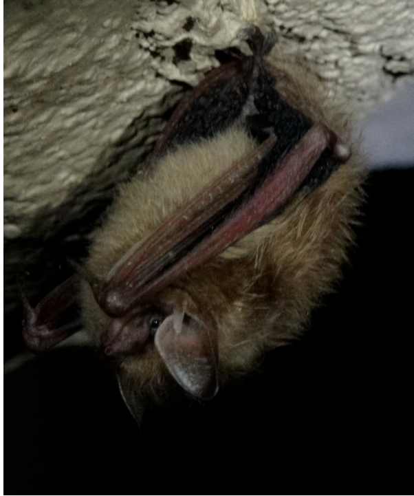
Figure 1.1. Perimyotis subflavus taken at White River Cave in 2012.