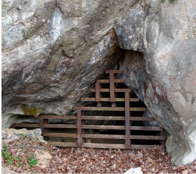
Figure 2.1. Bat gate of White River Cave.