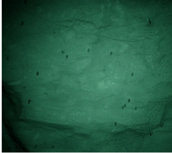
Figure 2.3. Typical aggregation pattern of P. subflavus seen in White River Cave, chamber 2.